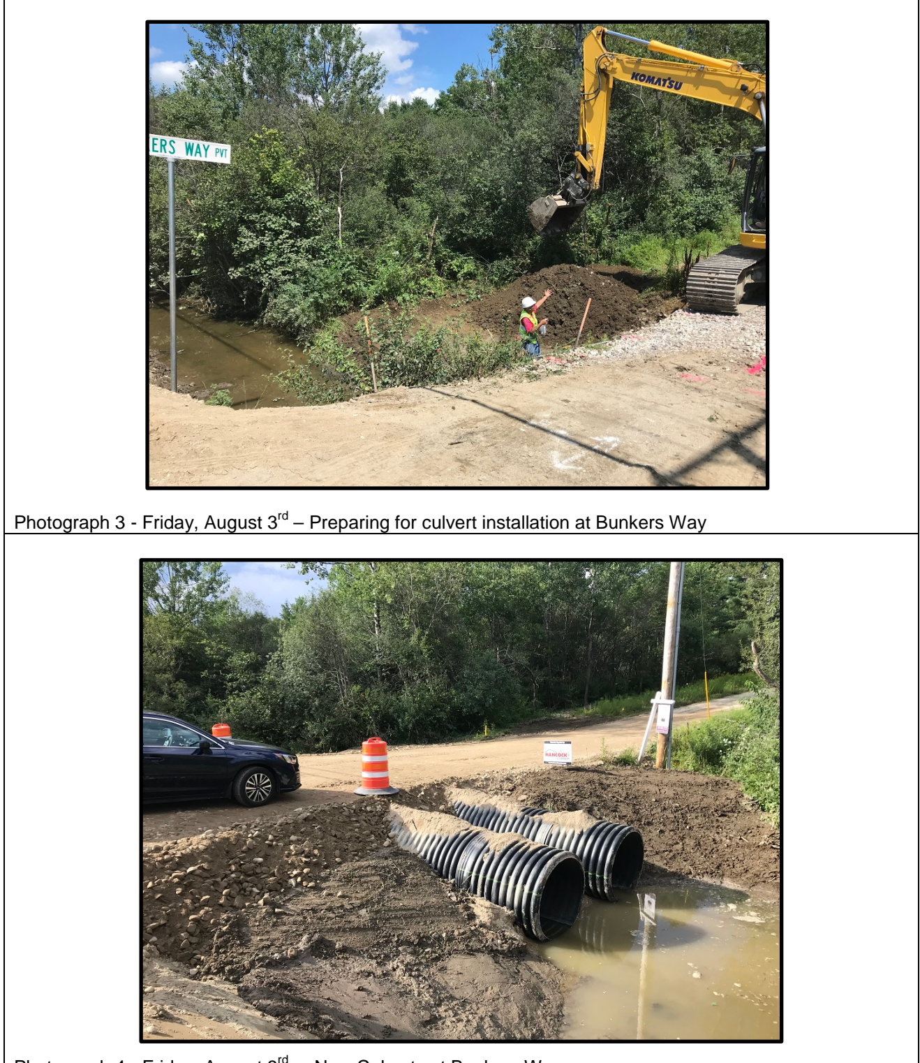
Photograph 4 - Friday, August 3<sup>rd</sup> – New Culverts at Bunkers Way

\\nserver\CFS\TCU\Tuttle Road\Construction\Weekly Reports\Photos\Weekly Photos 0802-0808.docx August 08, 2018 Page 2 of 4