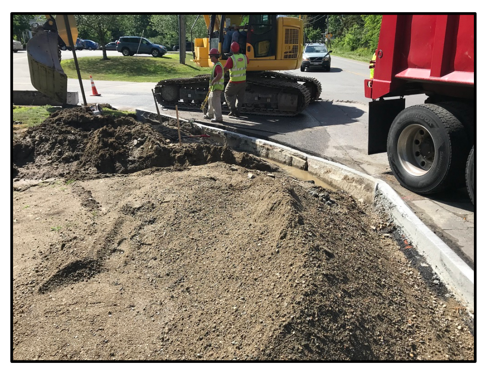
Photograph 6 - Monday, June 25<sup>th</sup> - Removing and resetting granite curb at Town Hall