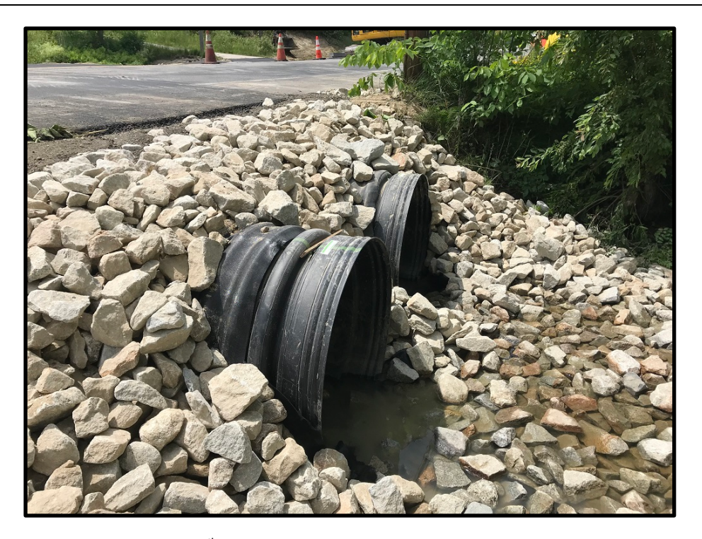
Photograph 9 - Wednesday, June 27<sup>th</sup> - Rip rap inlet for dual 36 inch culverts