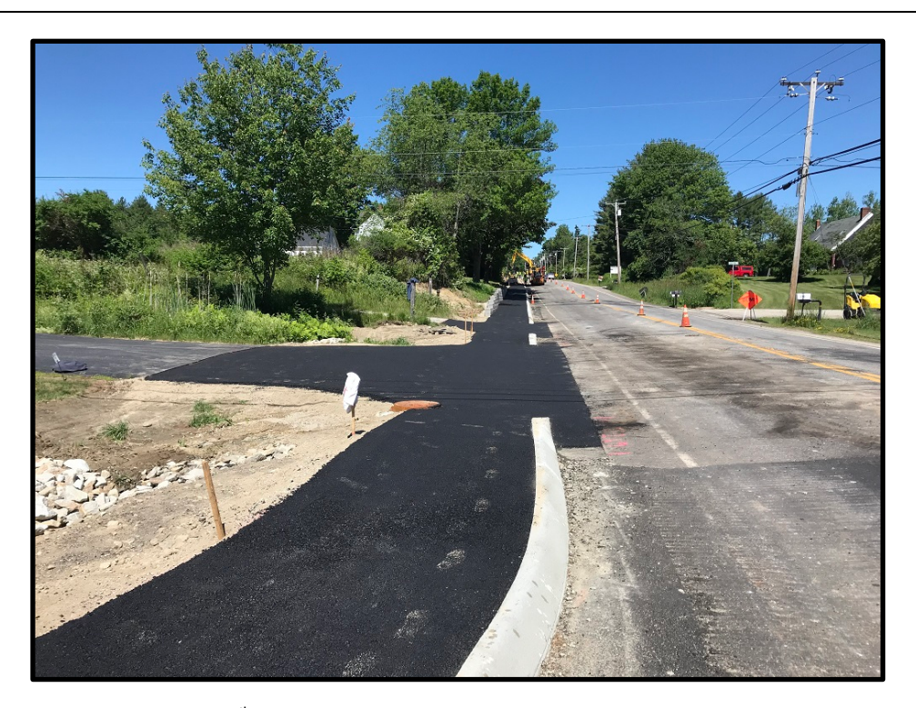
Photograph 7 - Tuesday, June 26<sup>th</sup> - Paved based course at 272 Tuttle Road