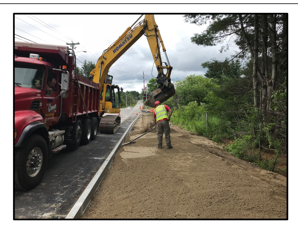
Photograph 5 - Monday, June 25<sup>th</sup> - Placing and grading gravel for sidewalk near rail road tracks