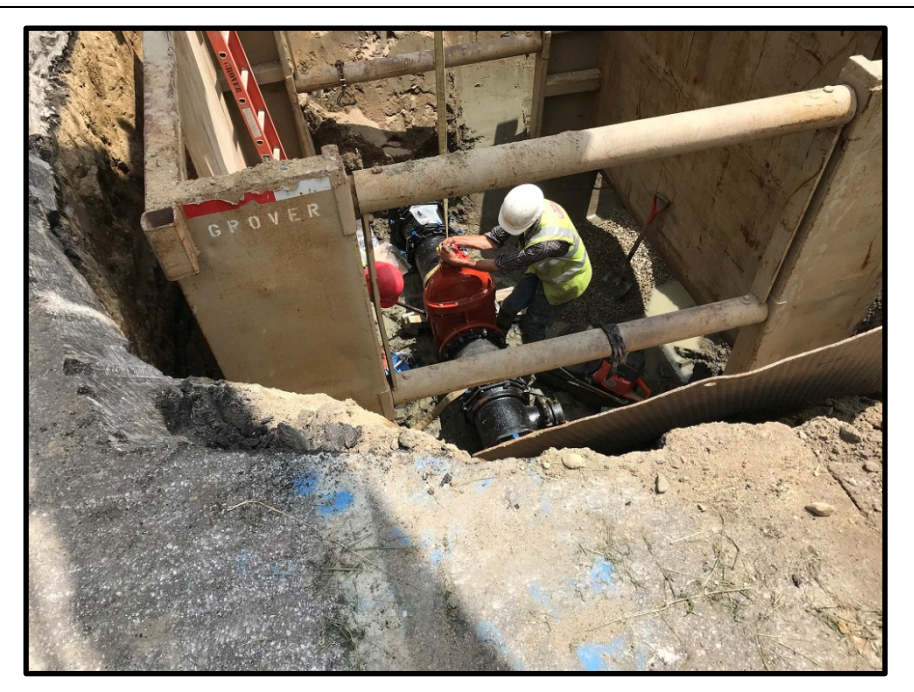
Photograph 1 – Thursday, June 21<sup>st</sup> – Installing 12 inch gate valve for eventual water main replacement on west side of limit of work