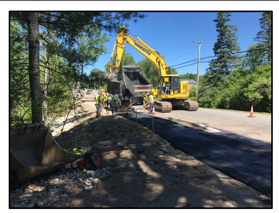
Photograph 8 - Tuesday, June 25<sup>th</sup> - Paving base course near Town Hall