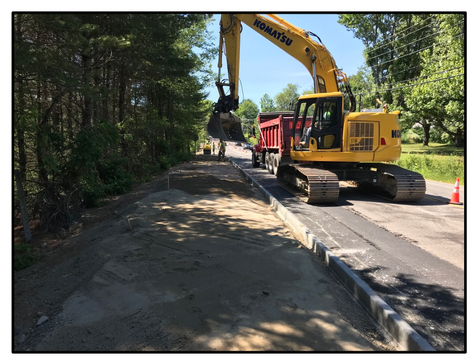
Photograph 4 - Friday, Friday 15<sup>th</sup> - Placing and grading gravel on sidewalk near rail road tracks