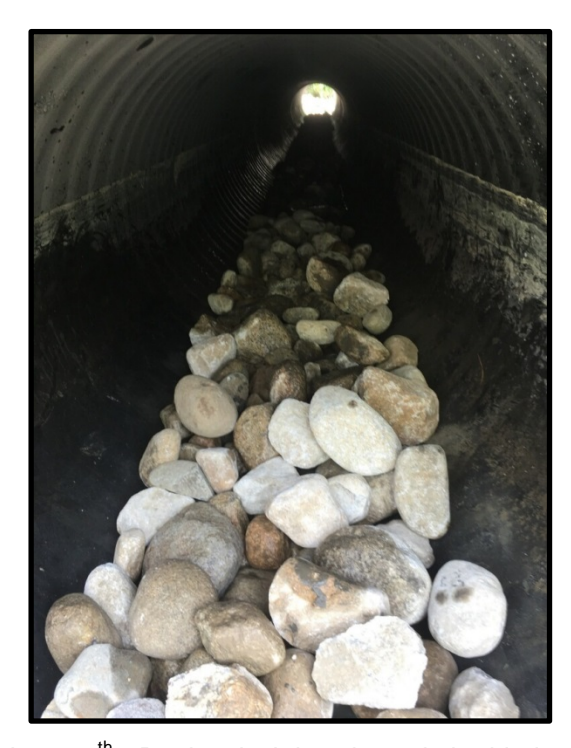
Photograph 10 - Wednesday, June 27^{th} – Dual 36 inch in culverts imbedded