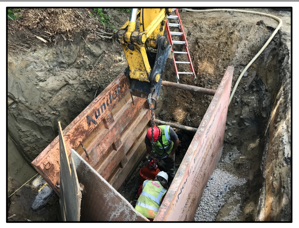
Photograph 2: Thursday, June 21<sup>st</sup> – Installing 12 inch gate valve for eventual water main replacement on east side of limit of work.