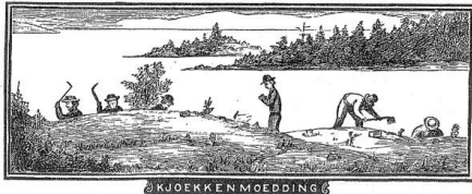
The Casco Bay Archaeological Project