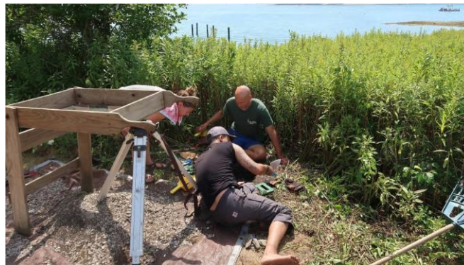
Picture of crew digging