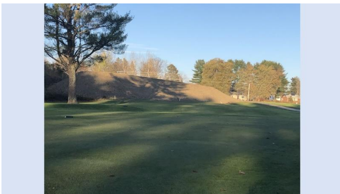
Berm to block storage shed from golf course