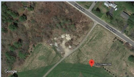
Location of storage shed at Val Halla

Salt Building Relocated to Valhalla Greely Road