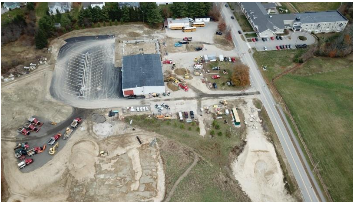
View of Public Works project