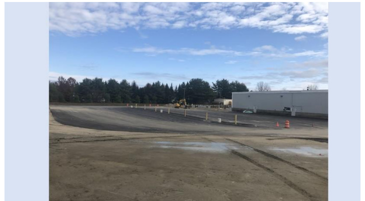
View from the former brush Facility