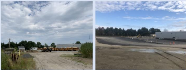
Public Works / SAD 51 Garage Expansion