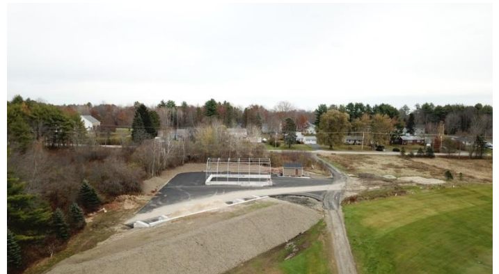
Val Halla storage shed – Greely Road