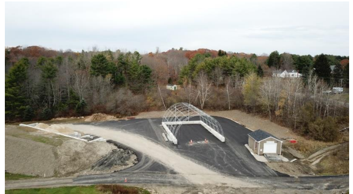
Val Halla storage shed on Greely Road