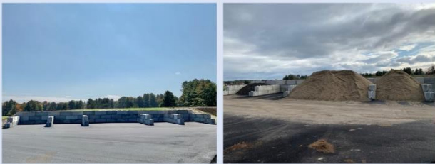
Val Halla – Greely Road side