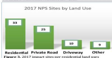
Figure 3. 2017 impact sites per residential land uses

The 2017 survey indicated that the majority of high and medium impact NPS sites were located on private roads. Driveways and residential properties were primarily ranked as low impact sites (Table 1).