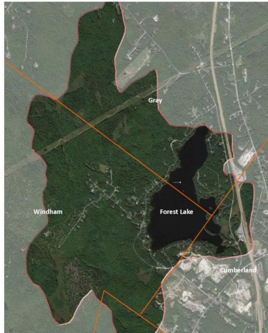
Figure 1: Forest Lake Watershed

Cumberland County Soil & Water Conservation District