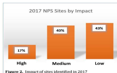
Figure 2. Impact of sites identified in 2017

Residential properties (43%), private roads (33%), and driveways (13%) accounted for most of the sites in the 2017 survey (Figure 3). This breakdown of sites by land use was surprisingly similar to the results of the 2002 survey, especially in regards to sites associated