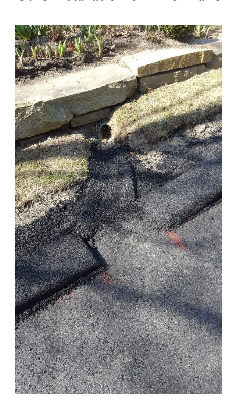
Paved swale to catch roof drain on the south side of the street.