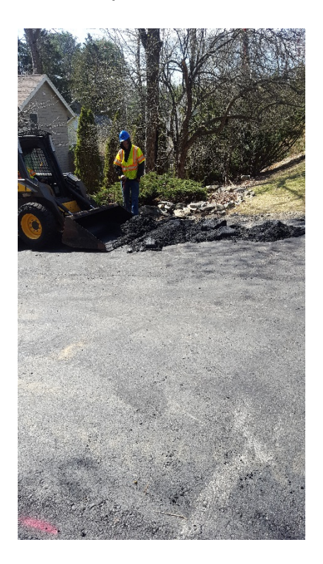
Unsatisfactory curb removal on the south side of the street.