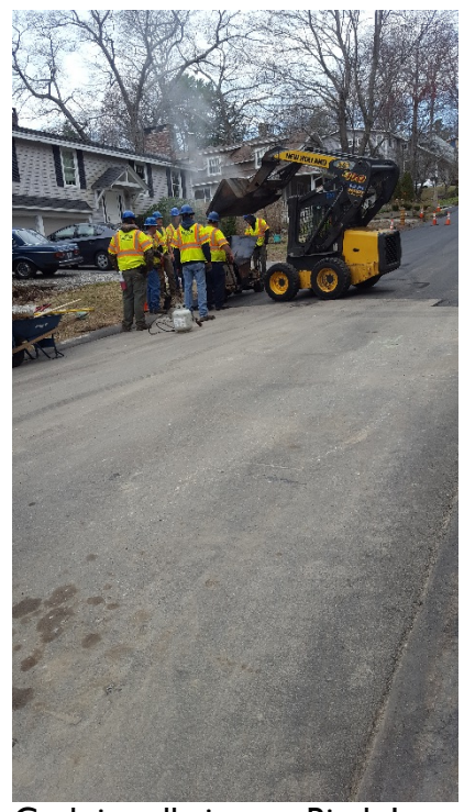
Curb installation on Birch Lane