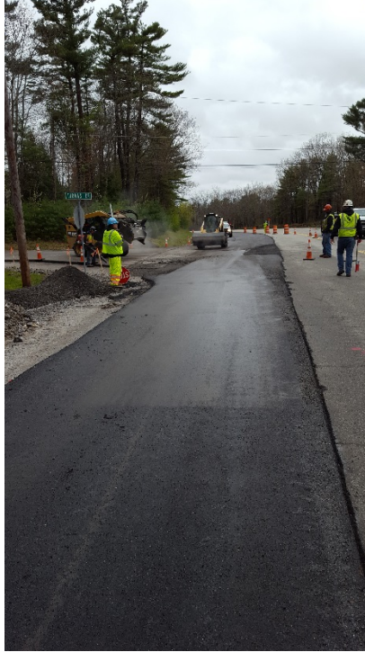
5/15/17 - Installing butt joint on Thomas Drive, looking south