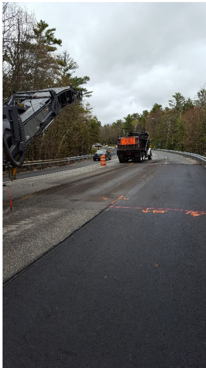
5/15/17 - Installing a butt joint on the north end of the project, looking north