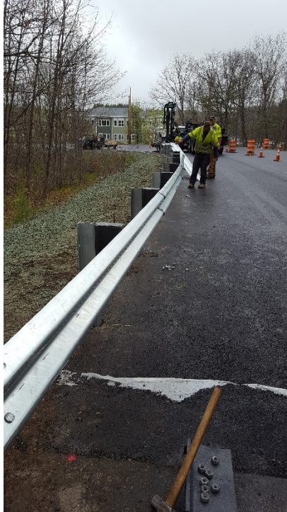
5/12/17 - Guardrail installation on the Tuttle Rd. Ramp