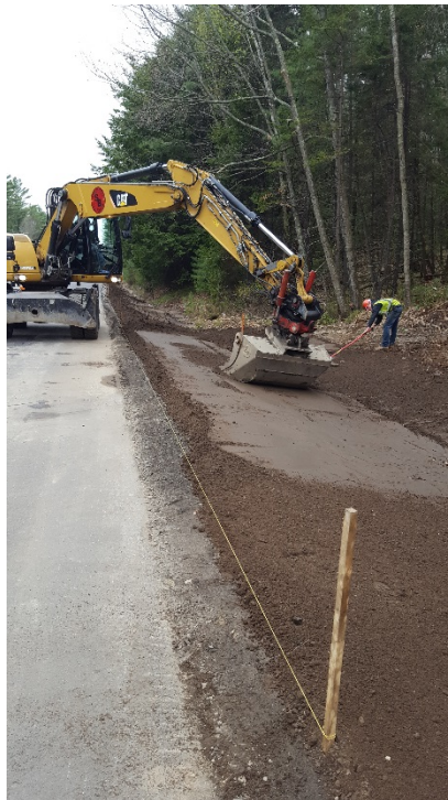
5/12/17 - Installation of reclaim shoulder, looking south