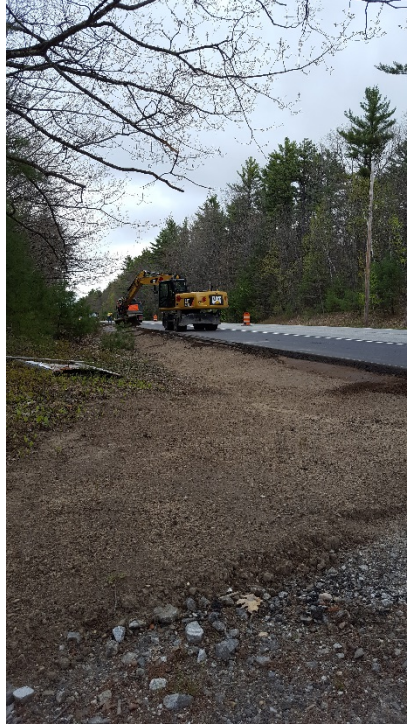
5/11/17 - Installation of reclaim shoulder, looking north