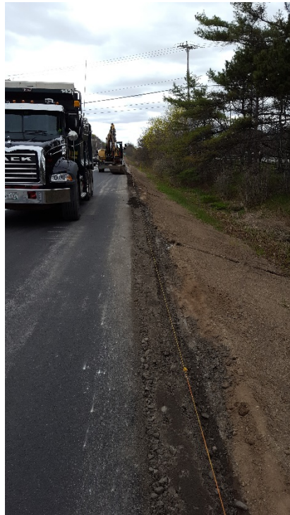
5/10/17 - Installation of reclaim shoulder, looking south