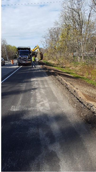
5/10/17 - Installation of reclaim shoulder, looking south