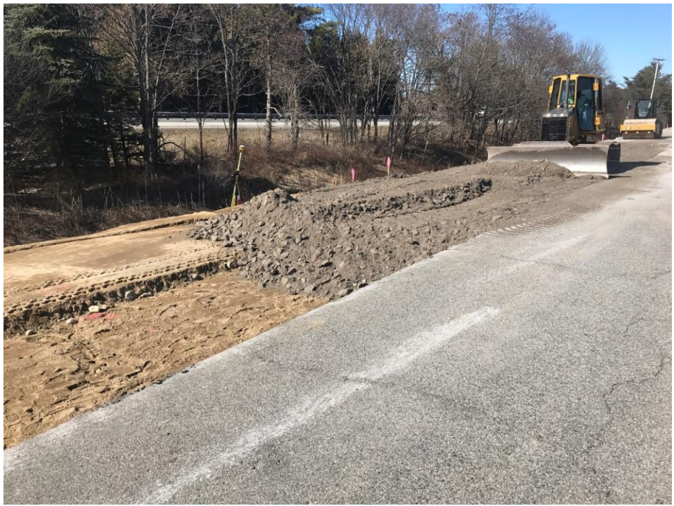
Photo 3 – Placing base gravel material near +/- sta. 106+00 (Afternoon).