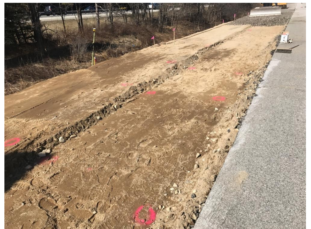
Photo 2 – Subbase graded in general conformance with typical sections (Afternoon).