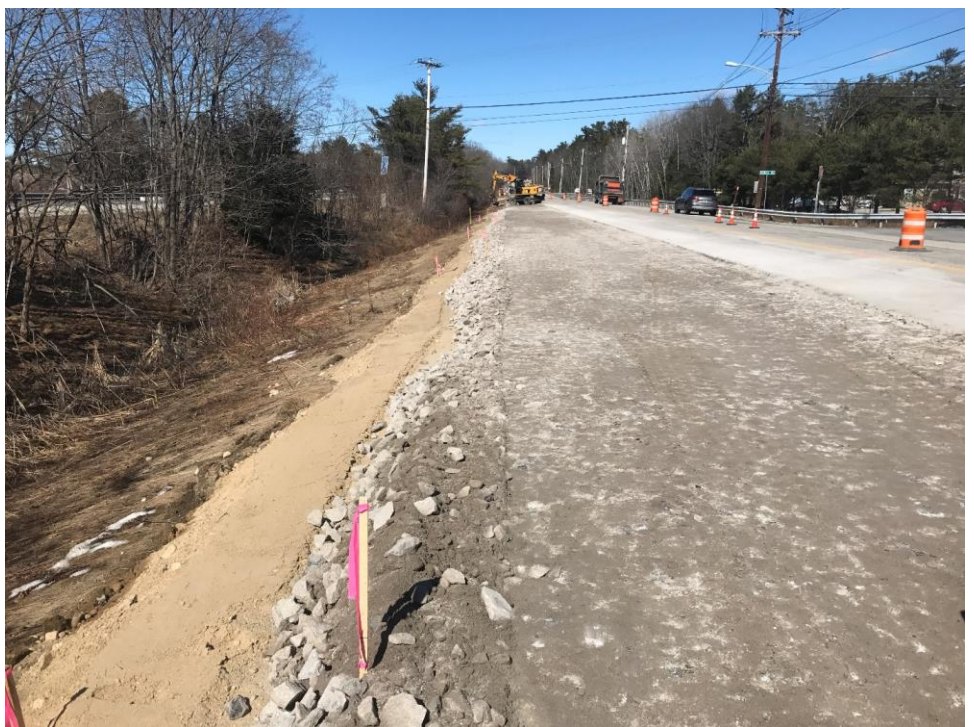
Photo 4 – Base gravel placed and compacted in left shoulder across from Powell Road (Afternoon).