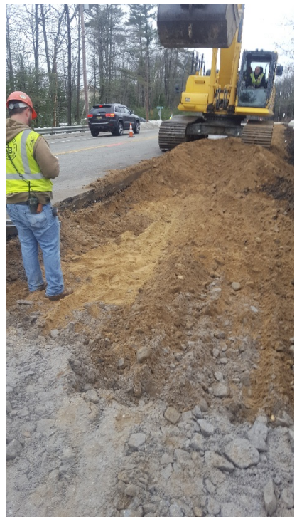
Removing existing gravel and base material in the left lane, looking south