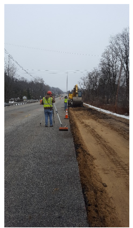
Crew verifying subgrade depth and slope in the left lane, Looking South,