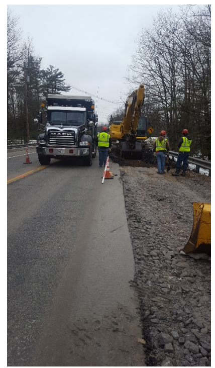
Placing and rough grading road base gravel in the left lane, looking south.