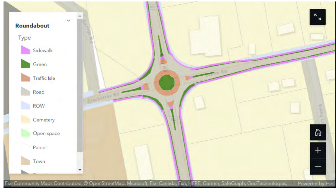
Draft Route 100 Roundabout