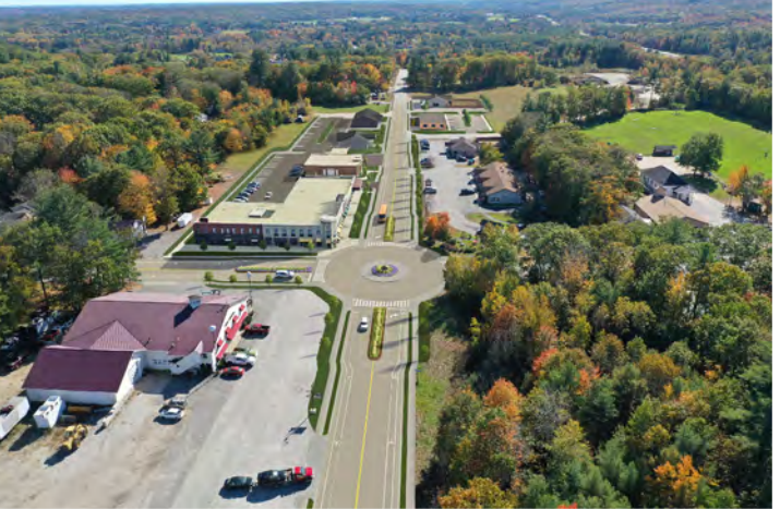
Birds Eye view of Proposed Roundabout (looking South on Gray Rd)