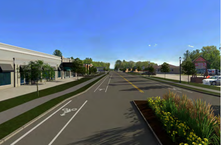
Gray Road looking south (south of the roundabout)

The center island of the roundabout provides the opportunity for a community gateway feature. Below are a few examples of how these central spaces can be designed.