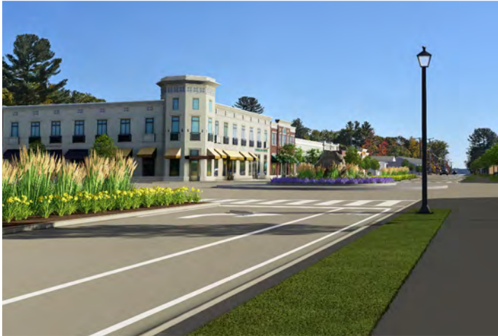
Gray Road (looking south through roundabout)