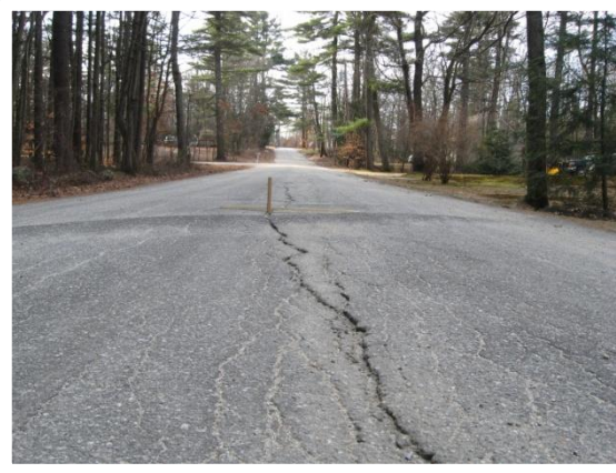
Old Gray Road