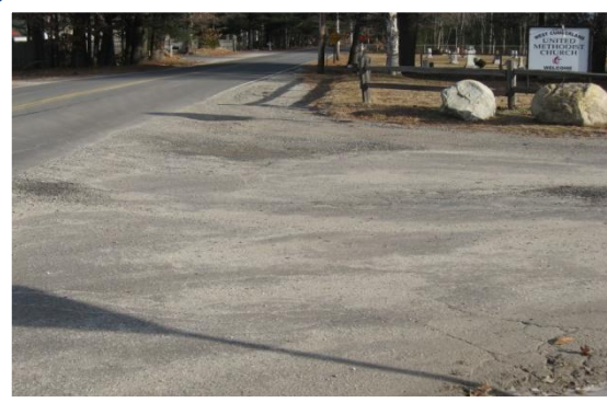
Upper Methodist Rd