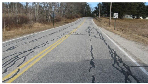
Bruce Hill to Range Rd