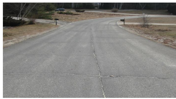
Fox Run Road