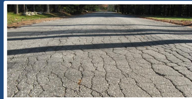
Blanchard Road Ext.