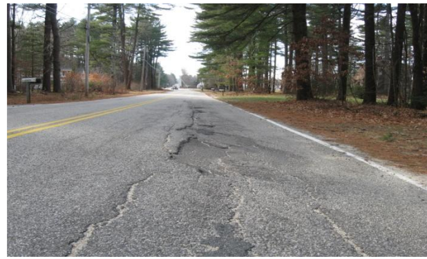
Bruce Hill Road