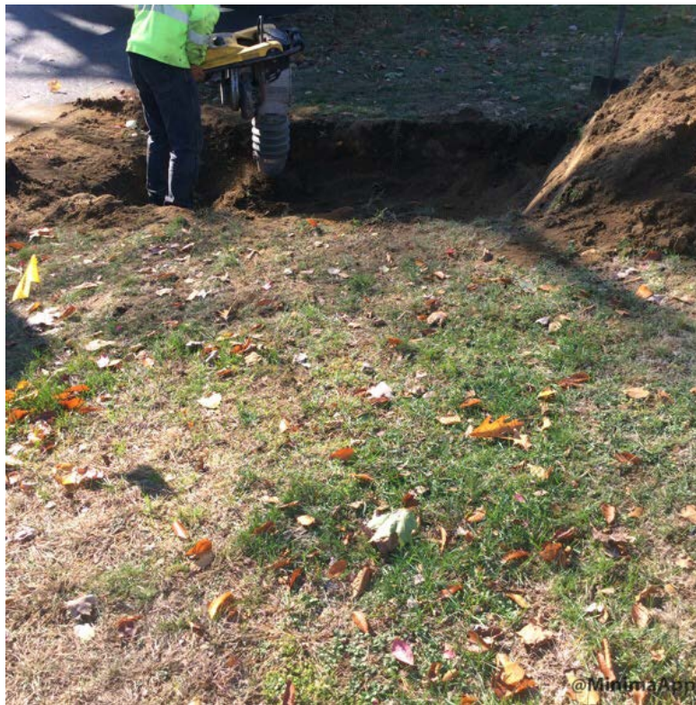
Compacting backfill with jumping jack at #11 Pinewood.