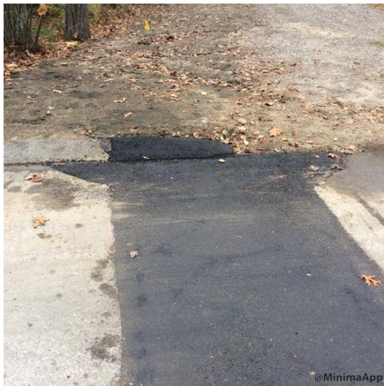
Hand built curb at #88 Skillin Road.