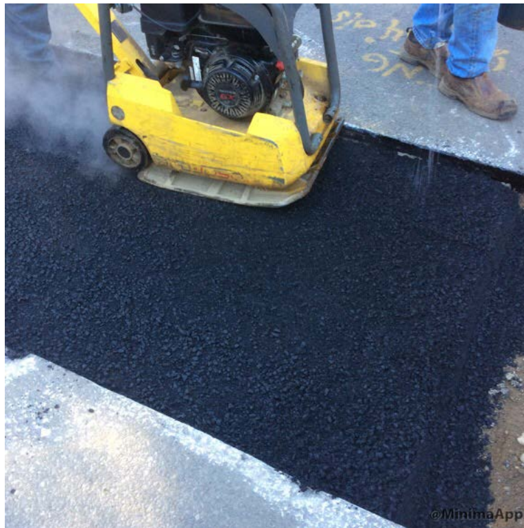
Compacting 12.5mm HMA with plate wacker.