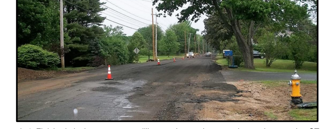
Photograph 4: Finished placing pavement millings at the southern terminus to be paved at STA 61+75 (Casey driveway at 121 Middle Road) on Tuesday afternoon June 27<sup>th</sup>.

\\nserver\CFS\TCU\Middle Road\Construction\Weekly Reports\Photos\Weekly Photos 0626-0705.docx July 6, 2017 Page 2 of 6