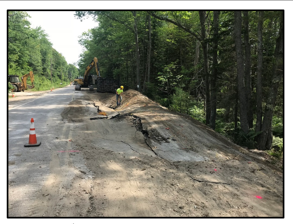
Photograph 5 – Monday, June 18<sup>th</sup> – Removing blasting mats after a blast