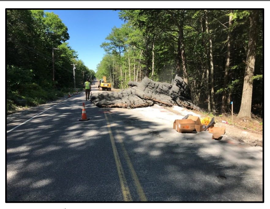
Photograph 8 - Tuesday, June 19<sup>th</sup> - After a blast near Tall Pines Way