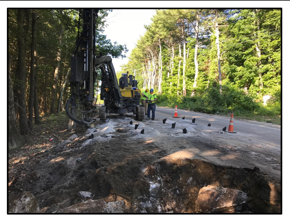
Photograph 7 – Wednesday, June 20^{th} – Drilling for first blast of the day