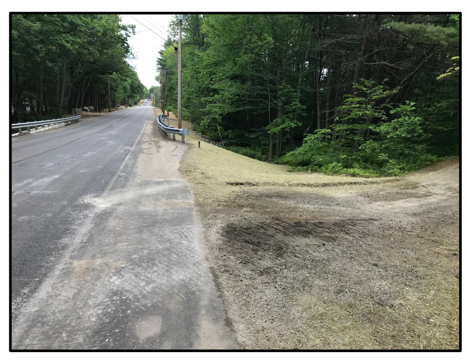
Photograph 4 - Friday, June 15<sup>th</sup> - Loam, seed, and Mulch at 31 Middle Road