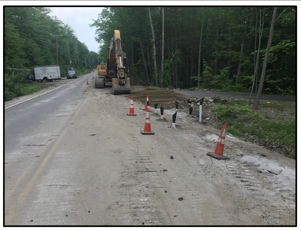
Photograph 6 - Monday, June 18^{th}\, – Cleaning up at the end of the day at 15 Middle Road