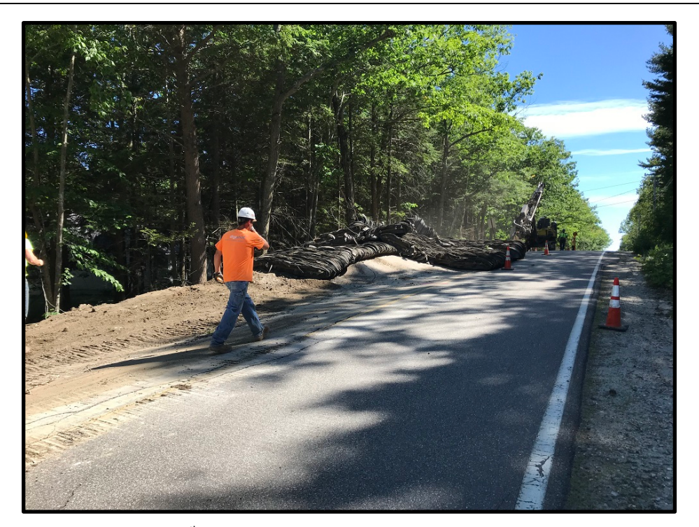
Photograph 7 – Tuesday, June 19<sup>th</sup> – After a blast in front of 15 Middle Road