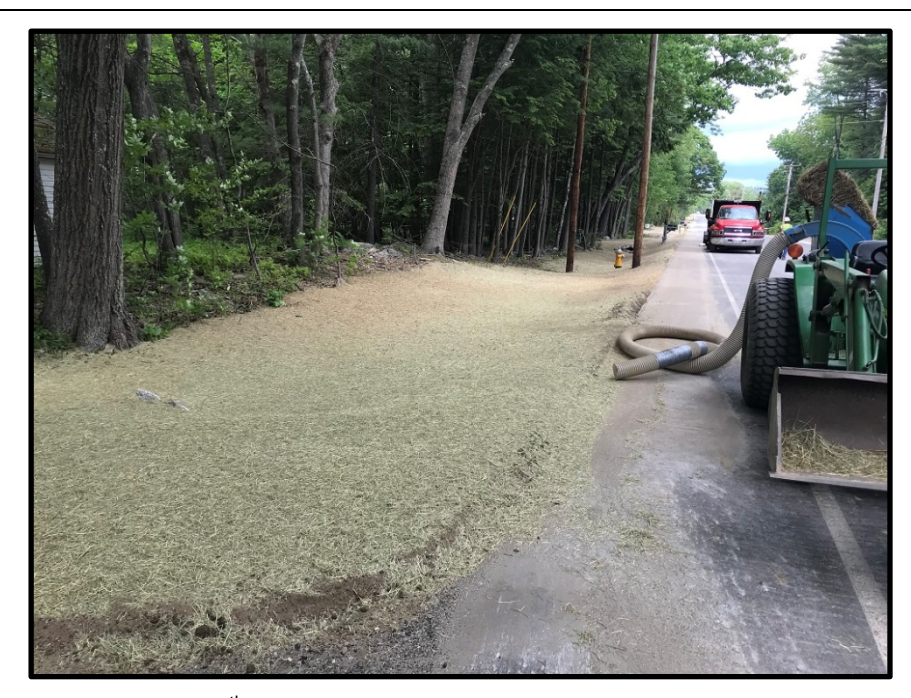
Photograph 1 – Thursday, June 14<sup>th</sup> – Loam, seed, and mulch near Evergreen Lane