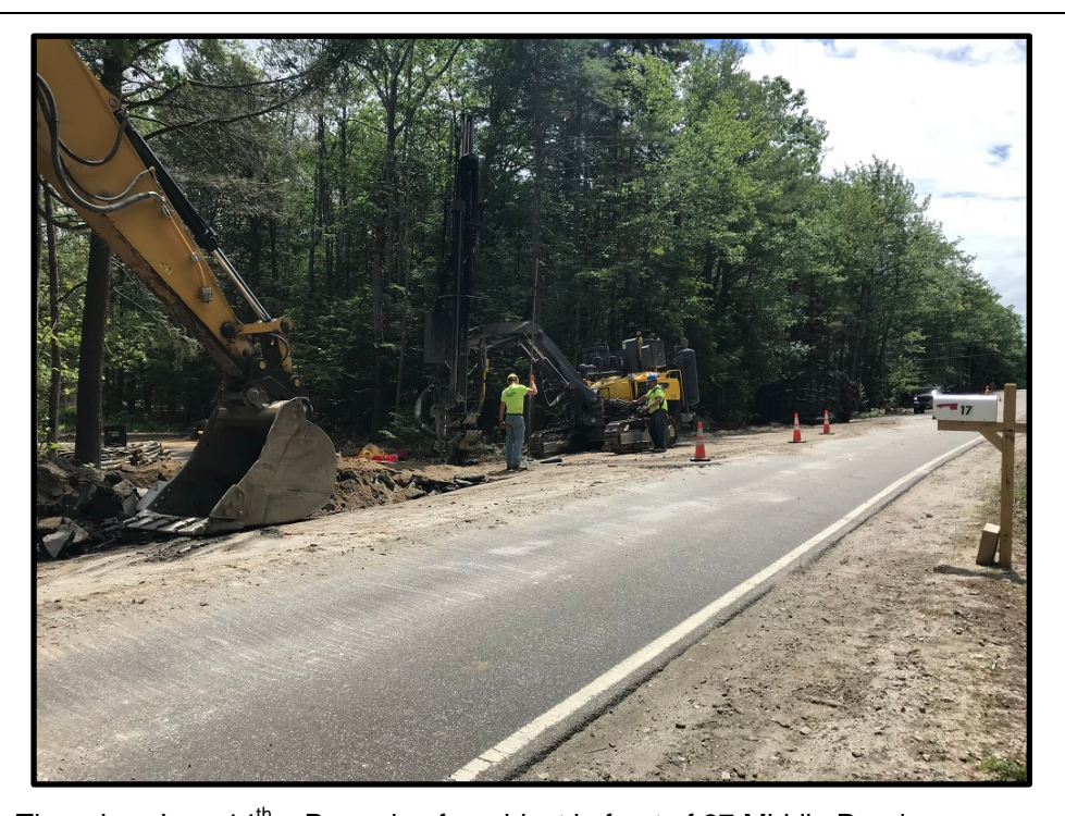
Photograph 2: Thursday, June 14<sup>th</sup> – Preparing for a blast in front of 27 Middle Road