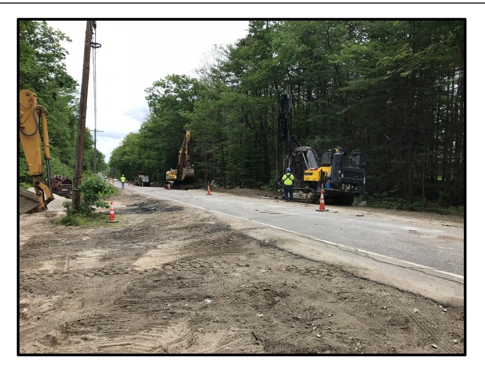
Photograph 3 - Friday , June 15th - Cleaning up after a blast near 17 Middle Road