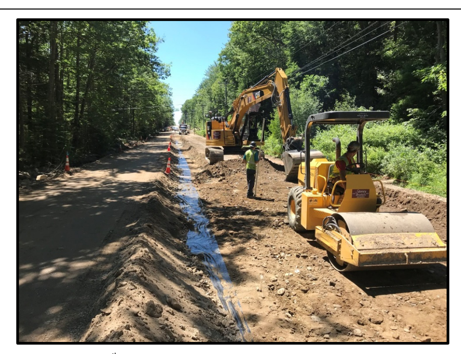
Photograph 1 – Thursday, July 19<sup>th</sup> – Excavating to base grade near 23 Middle Road