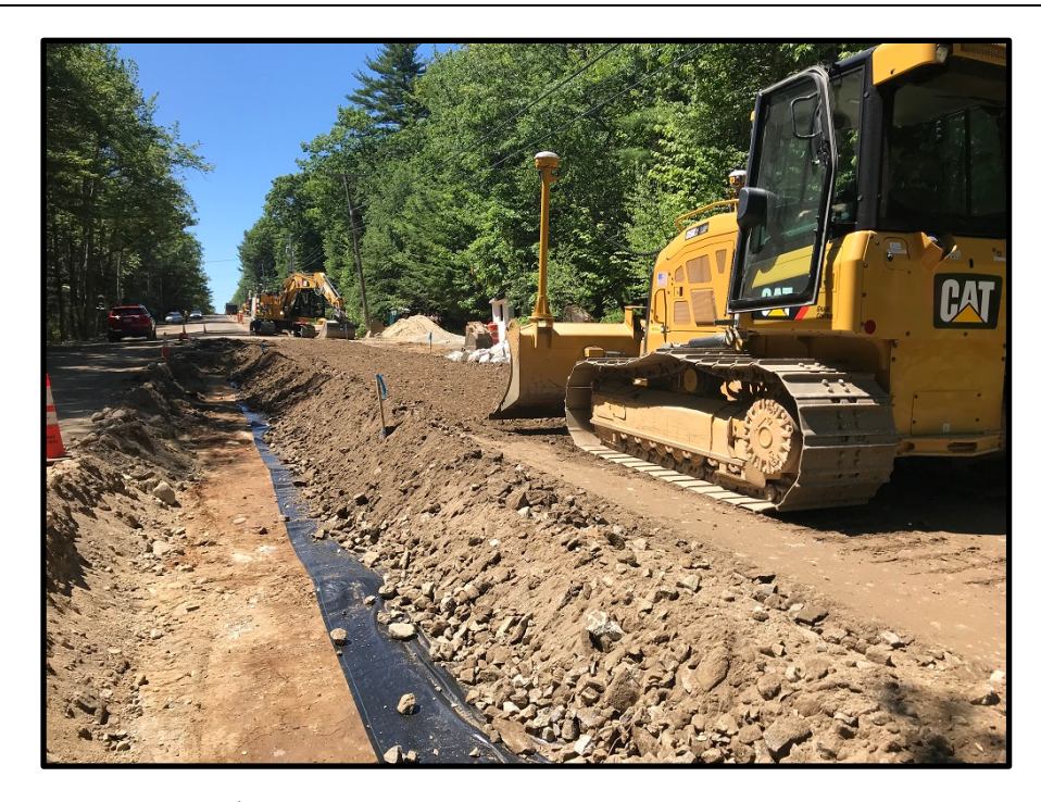
Photograph 3 - Friday , July 20<sup>th</sup> – Grading subbase gravel near existing bus turnaround