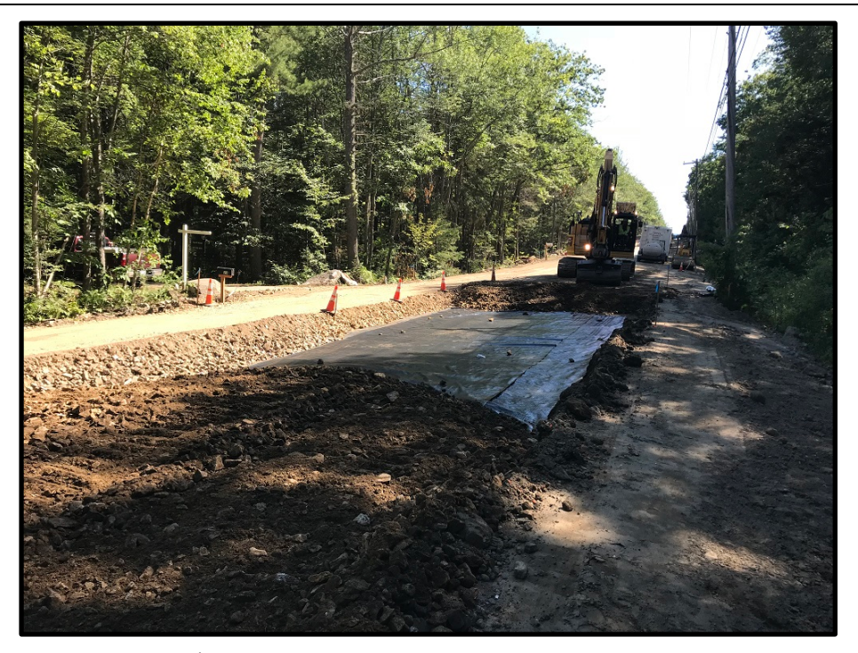
Photograph 2: Thursday, July 19<sup>th</sup> – Placing subbase gravel