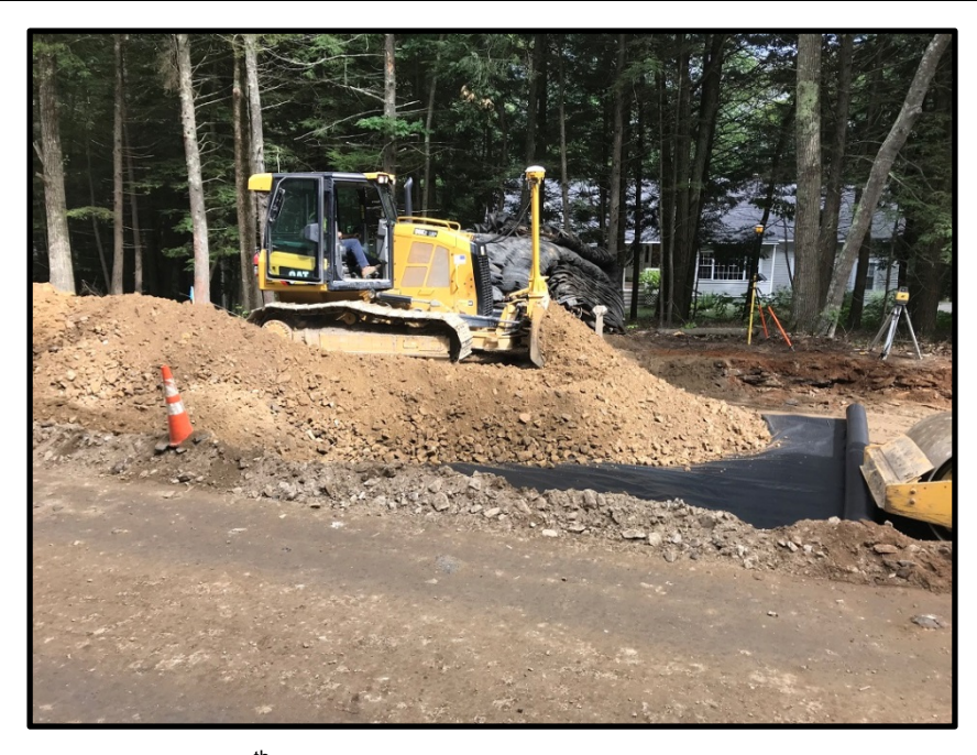
Photograph 8 - Wednesday, July 25<sup>th</sup> - Placing subbase gravel near Tall Pines Way