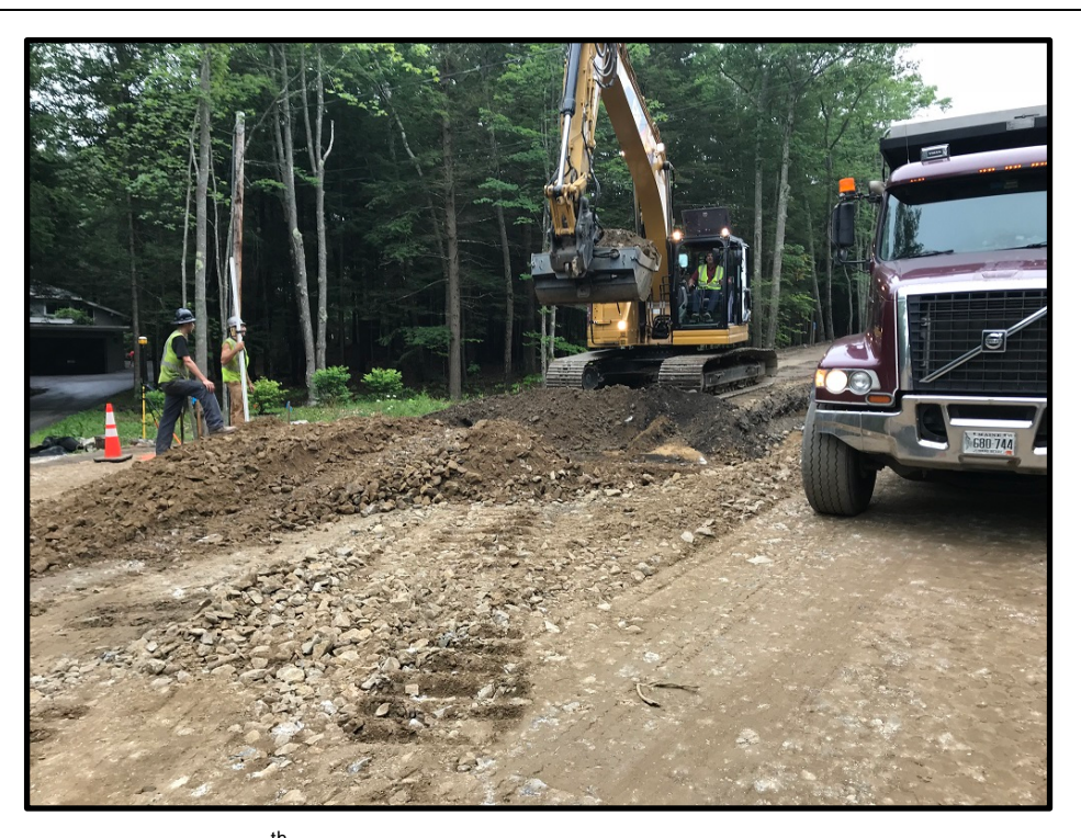
Photograph 8 - Tuesday, July 24<sup>th</sup> – Excavating for base grade near 15 Middle Road