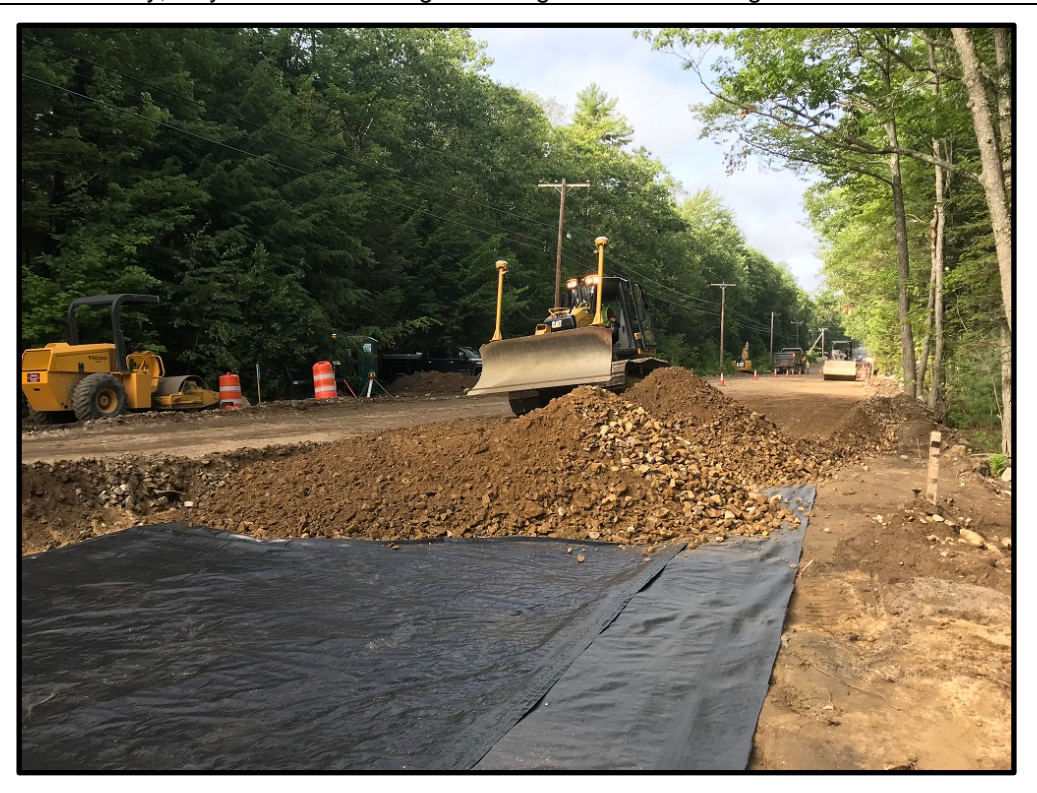
Photograph 6 - Monday, July 23<sup>th</sup> - Placing subbase gravel