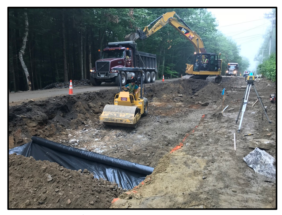
Photograph 7 – Wednesday, July 25<sup>th</sup> – Excavating for base grade near Tall Pines Way