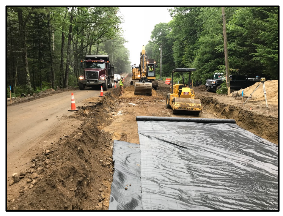
Photograph 5 – Monday, July 23<sup>th</sup> – Excavating to base grade near existing bus turnaround