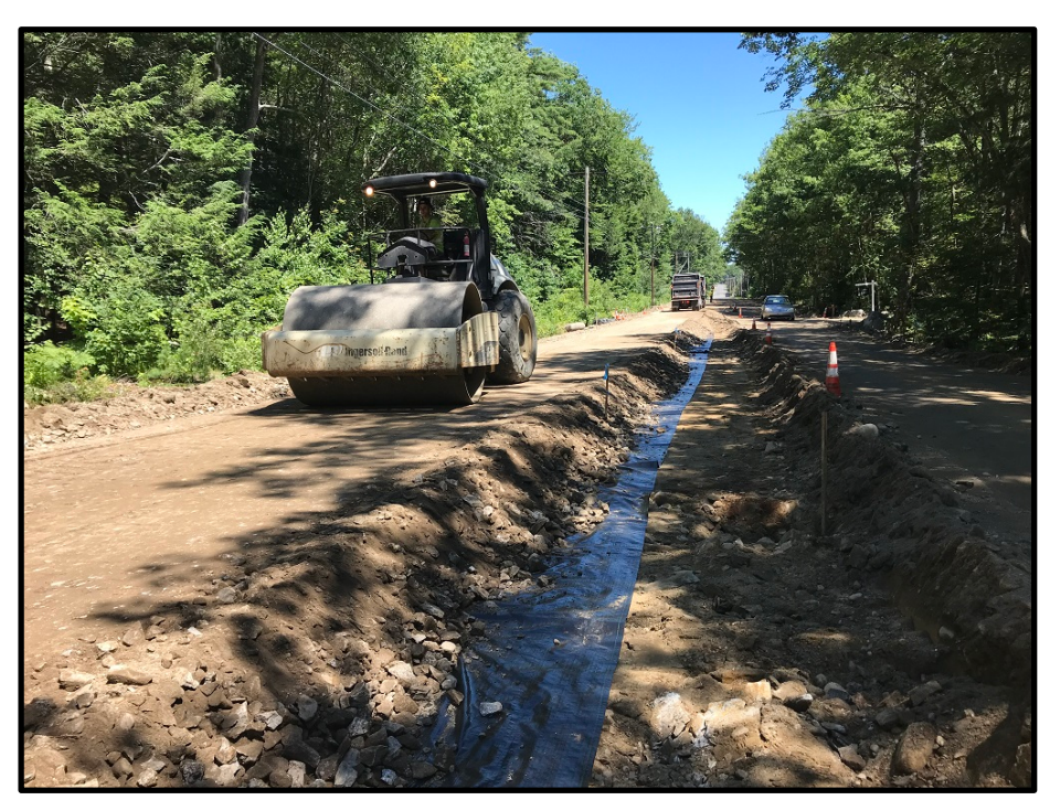
Photograph 4 - Friday, July 20<sup>th</sup> – Compacting subbase gravel