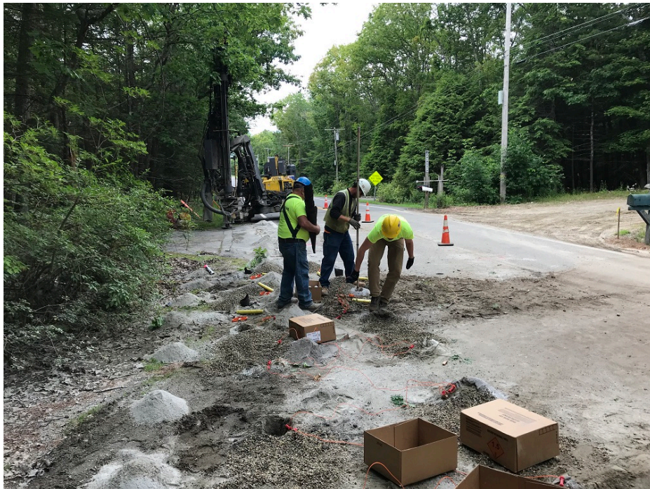
Photo 8 – Loading for second blast of the day near Falmouth Town Line.