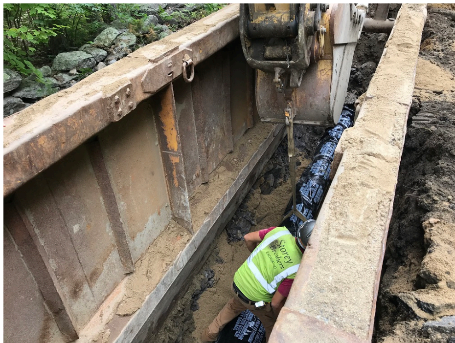
Photo 1 – Installing 12 inch water main in front of 27 Middle Road