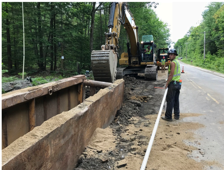
Photo 2 – Excavating for 12 inch water main south of driveway to 27 Middle Road