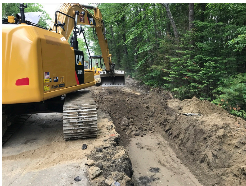
Photo 4 – Backfilling 12 inch water main trench in front of 27 Middle Road