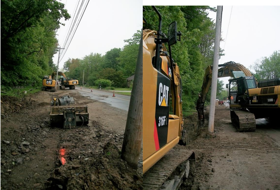
Gas line trench alignment south of Pole 337 (left). Close-up of ledge removal at same location (right).