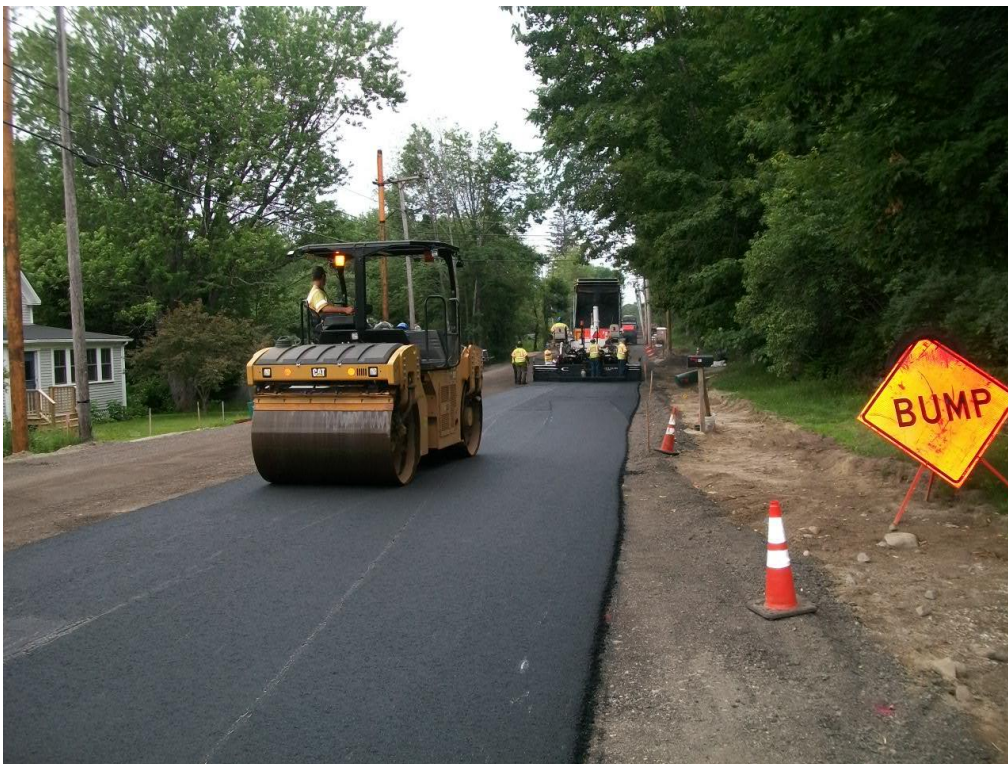
Knockdown roller following behind the paver soon after the operation got underway.