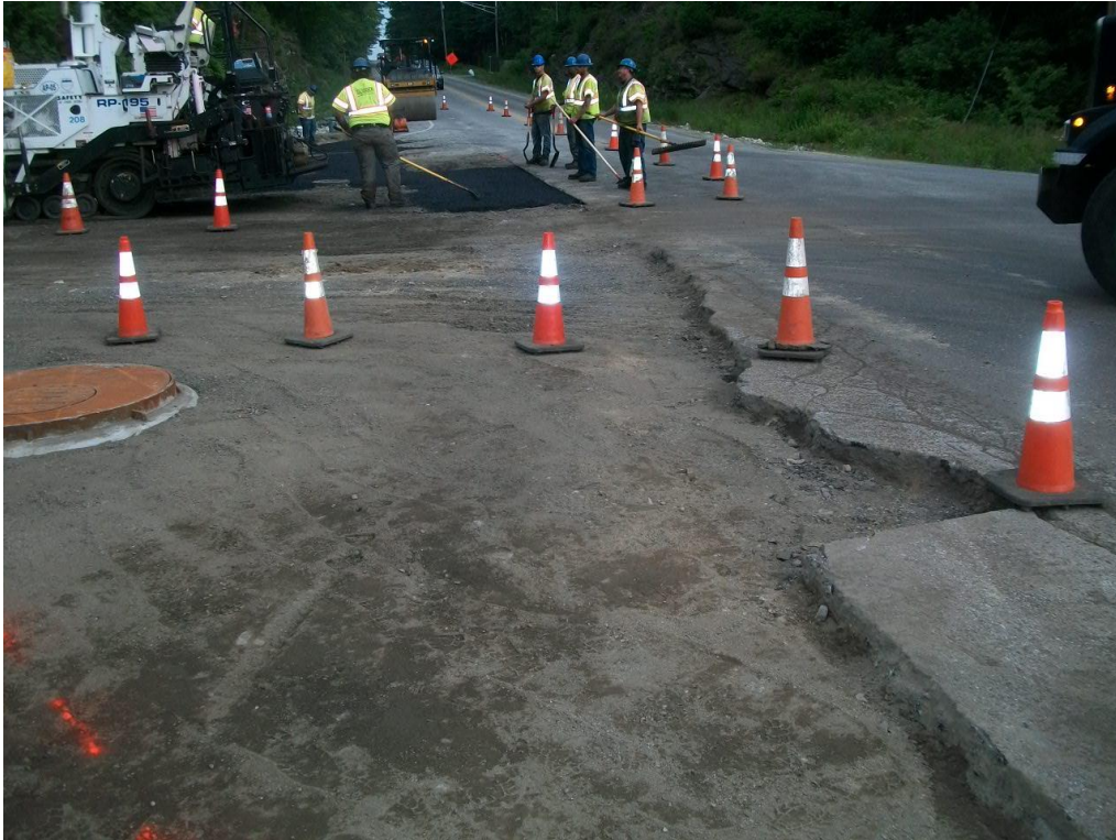
Hand placing along irregular joint at the Tuttle Road intersection at the start of day.