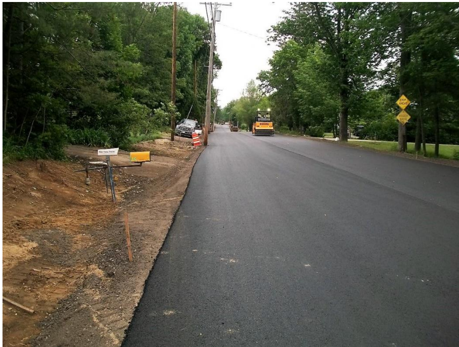
View near the end of the day depicting the Rubber Tire roller following behind the knockdown roller. Finishing roller further behind the rubber tire roller.