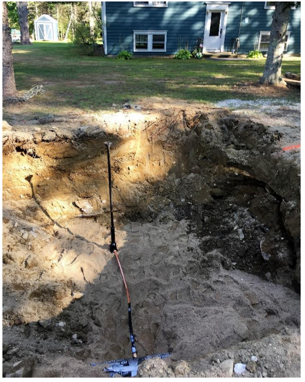
Location of water service at 77 Middle Road per the homeowner for convenient connection at later date.