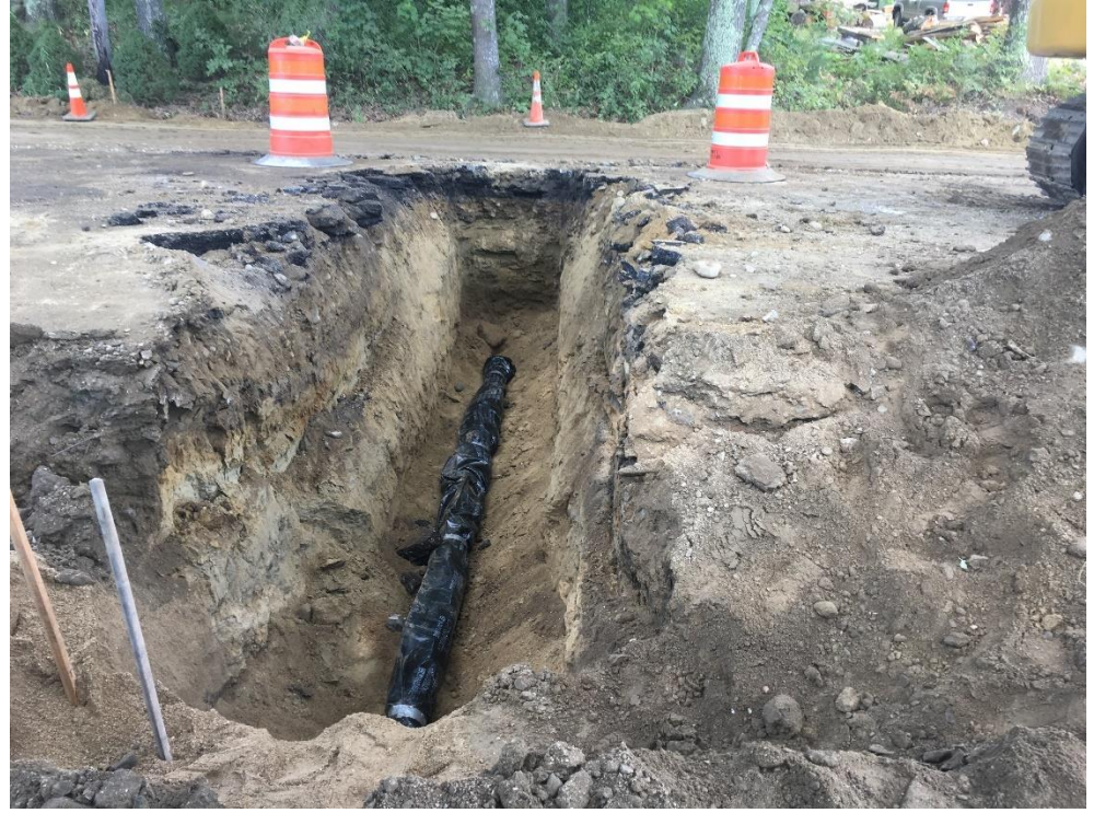
Trenching across road for hydrant at 76 Middle Road (STA 37+60).