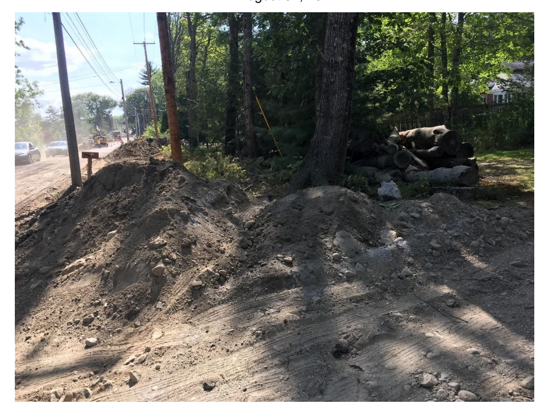
Location where southbound vehicle went off the west side of the road in front of 88 Middle Road as viewed from the north looking south. Pole #315 in background. Note tire marks on each side of mound in front of tree.