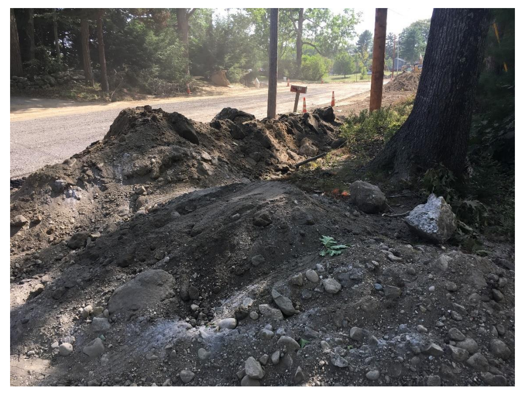
Same location as photo above but viewed from the western side.