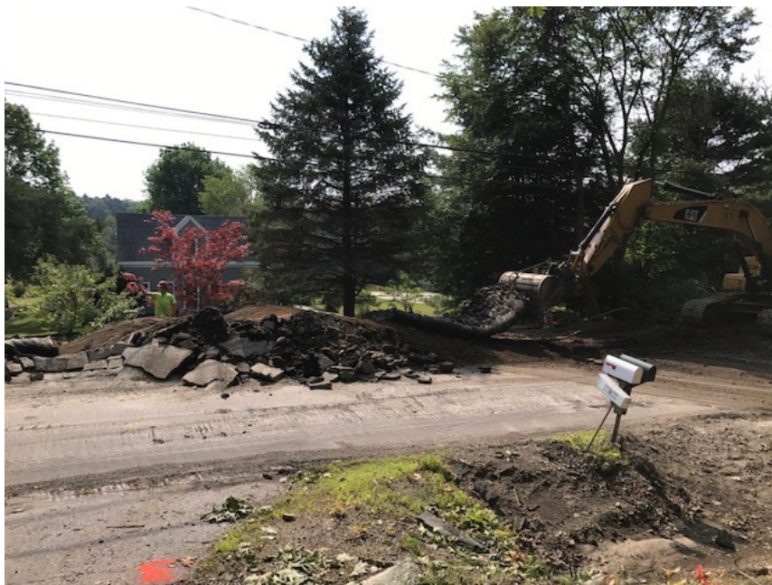
Post blast after mat removal STA 34+00.