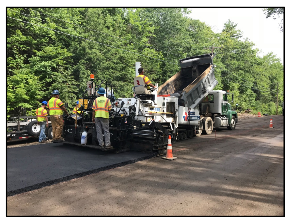
Photograph 7 – Tuesday, July 31<sup>st</sup> – Paving west travel lane near existing bus turnaround