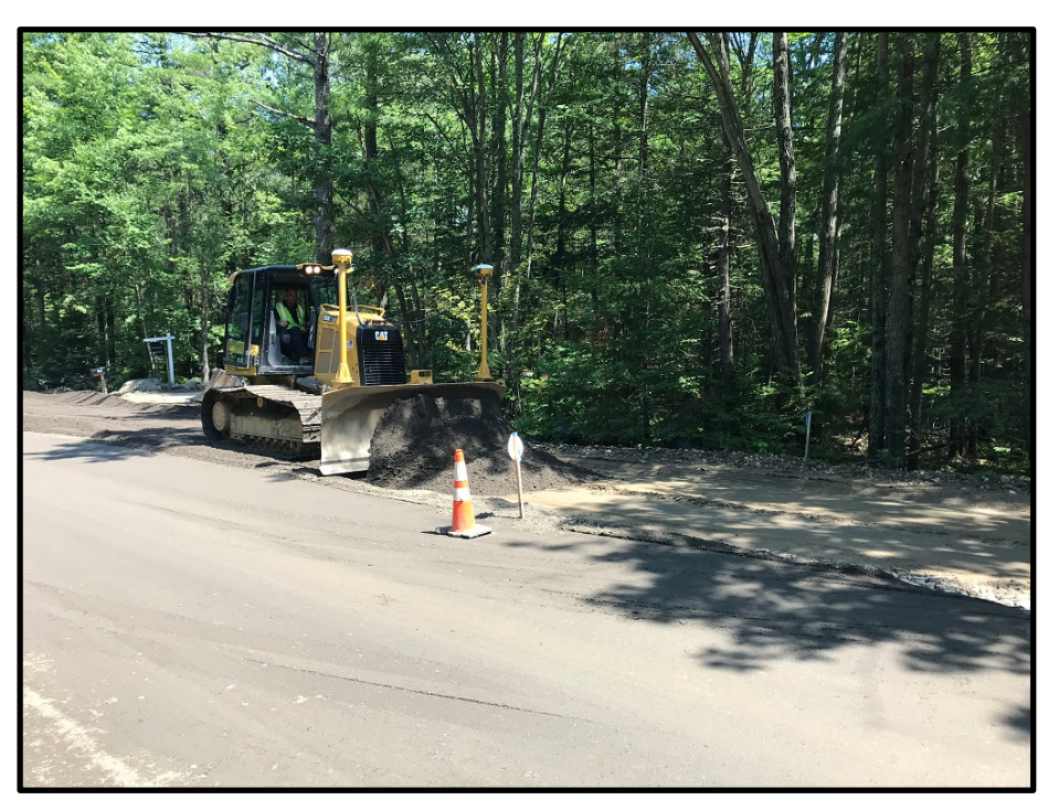
Photograph 4 - Friday, July 27<sup>th</sup> - Grading reclaim near 23 Middle Road