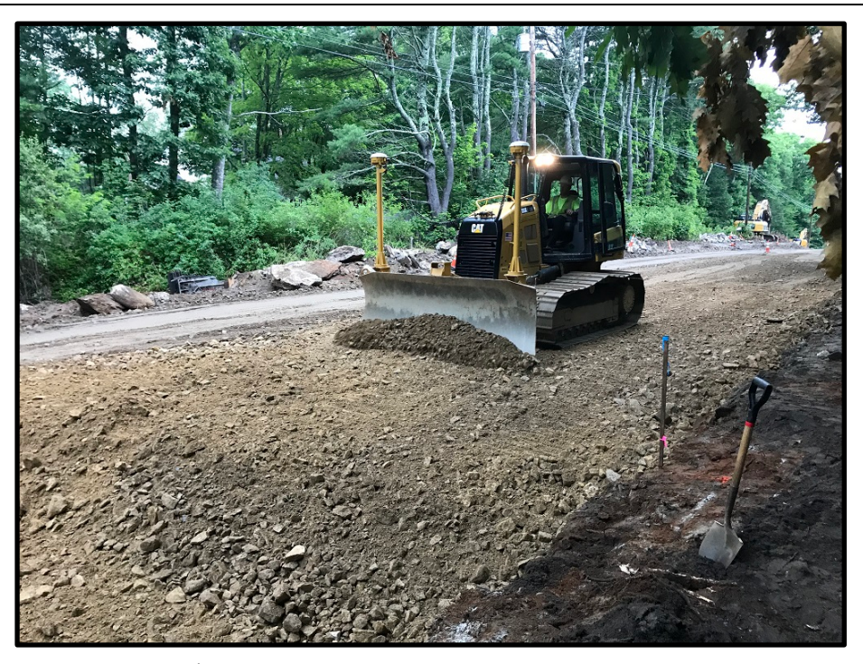
Photograph 2: Thursday, July 26<sup>th</sup> – Grading subbase gravel near Falmouth Town Line