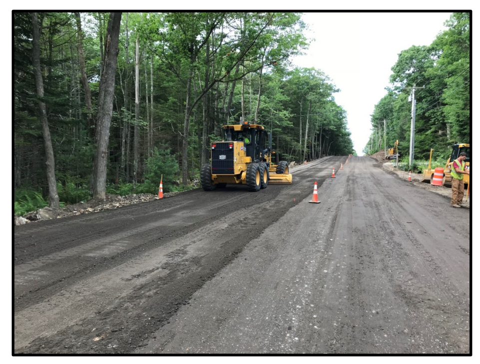
Photograph 5 – Monday, July 30<sup>th</sup> – Fine grading near 15 Middle Road