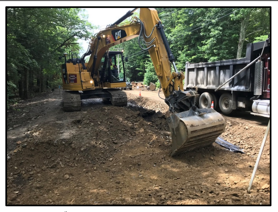
Photograph 1 – Thursday, July 26<sup>th</sup> – Excavating to base grade at Tall Pines Way