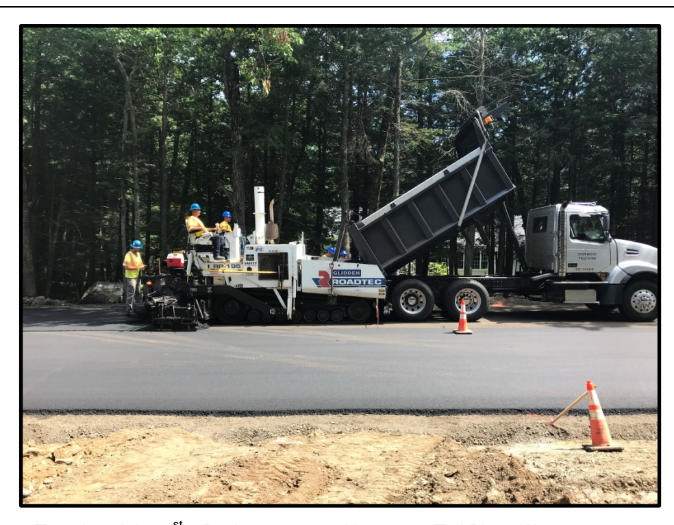
Photograph 8 - Tuesday, July 31st - Paving east travel lane near Tall Pines Way