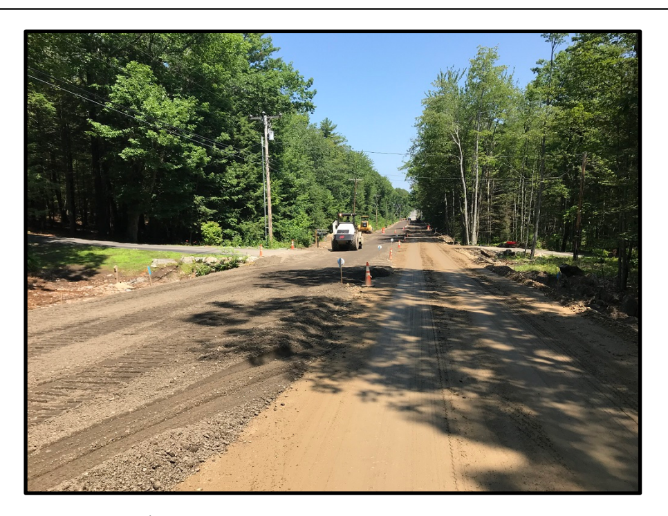
Photograph 3 - Friday , July 27<sup>th</sup> – Compacting reclaim near 10 Middle Road