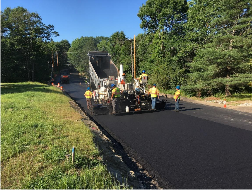
Crew from Glidden Paving just underway a 8AM placing 2 nd layer of base pavement .