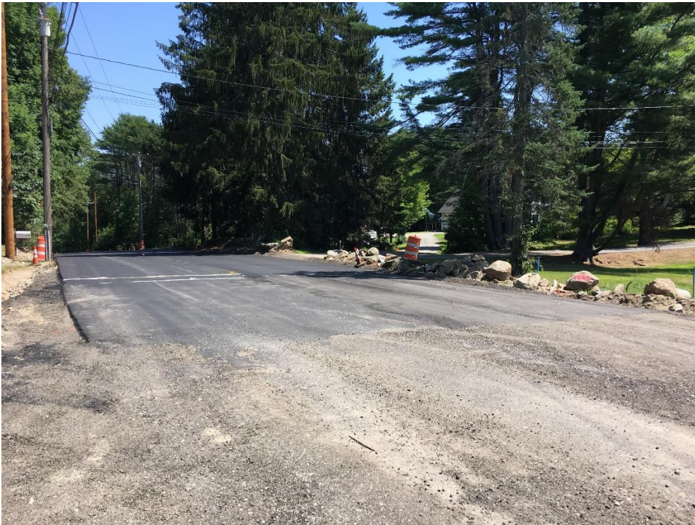
Southern terminus of pavement after 2 nd layer of base pavement was placed in the northbound lane of the current work zone.