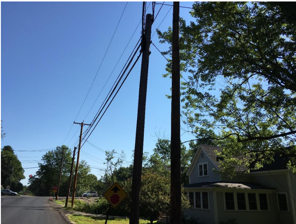
Northern extent of electric wires transfer at Pole 340½ (except no transfer yet at Pole 339 crossing road at STA 80+29, Left).