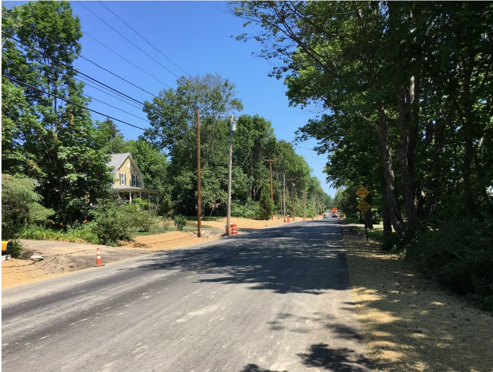
Southern extent of electric wires transfer to new poles at Pole 334 (STA 72+89, Left).