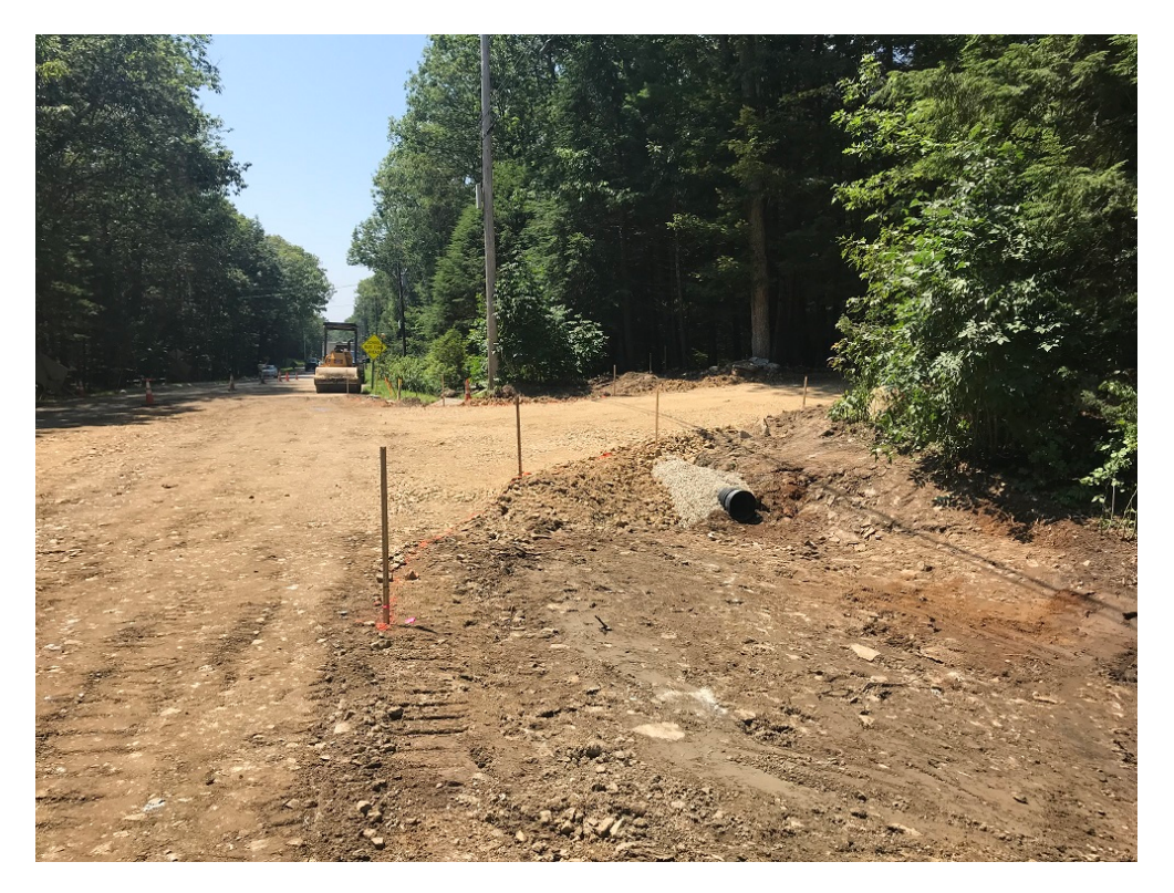
Photo 3 – Installed culvert and graded bust turnaround at 4 Middle Road