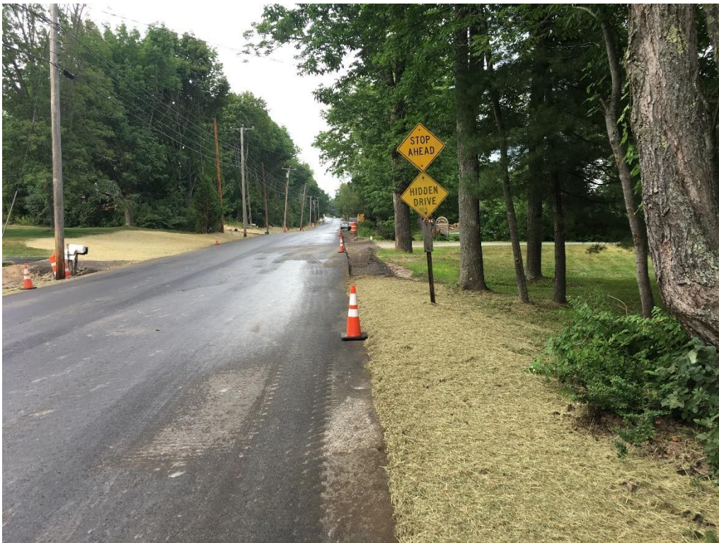
Northern extent of loam, seed, & mulched along east side of road from Butterworth Farm.