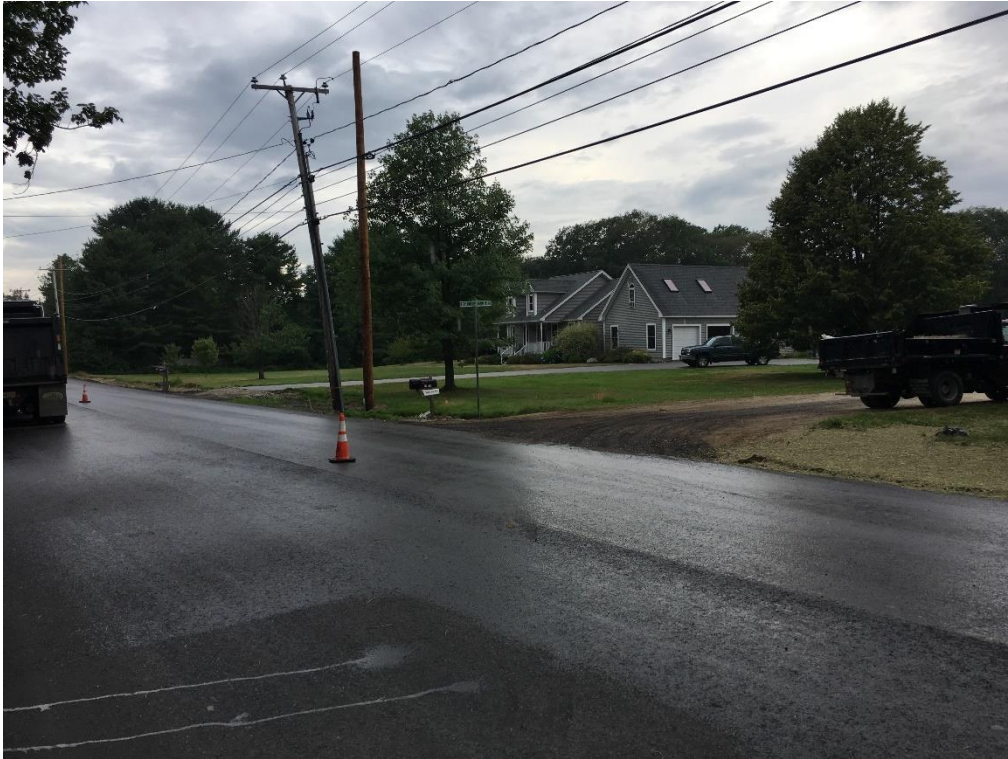
Southern extent of loam, seed, & mulch along west side of road at Butterworth Farm.