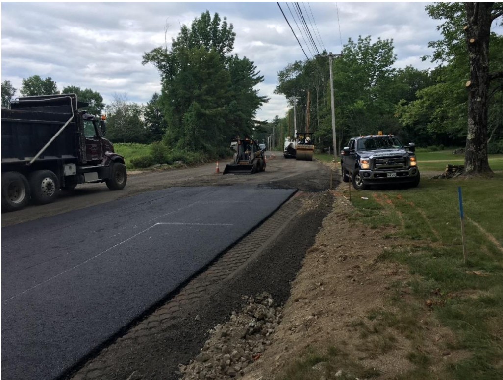
Southern terminus of the first layer of pavement in the southbound lane.