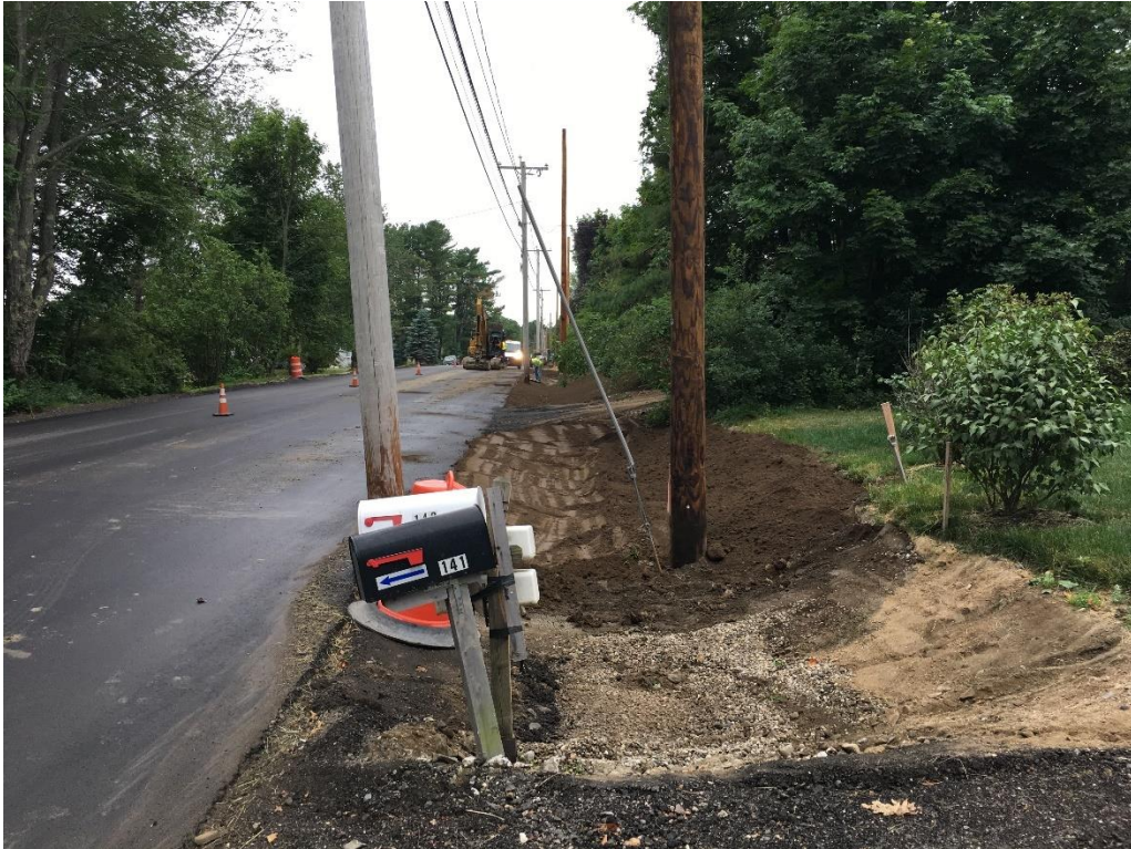
Freshly loamed and seeded swale north of 142 Middle Road (looking north).