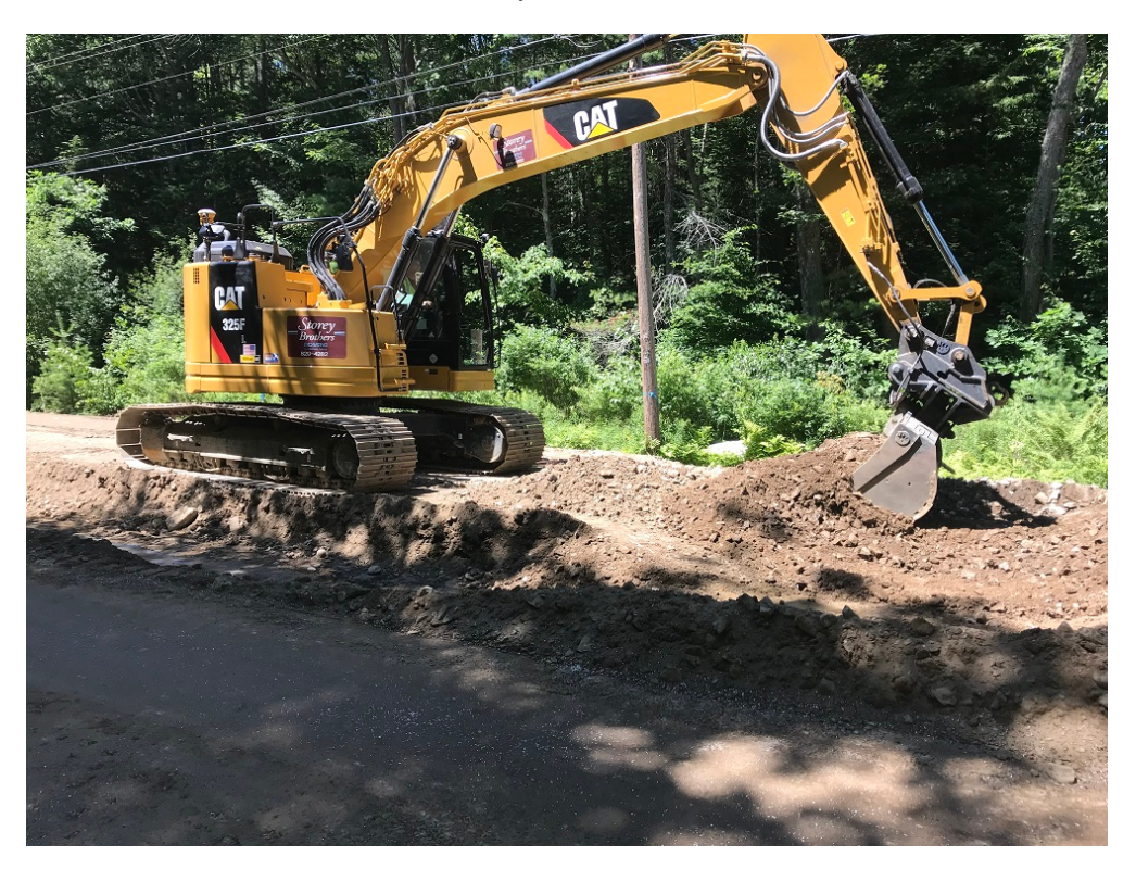
Photo 1 – Excavating to subgrade for full depth road reconstruction