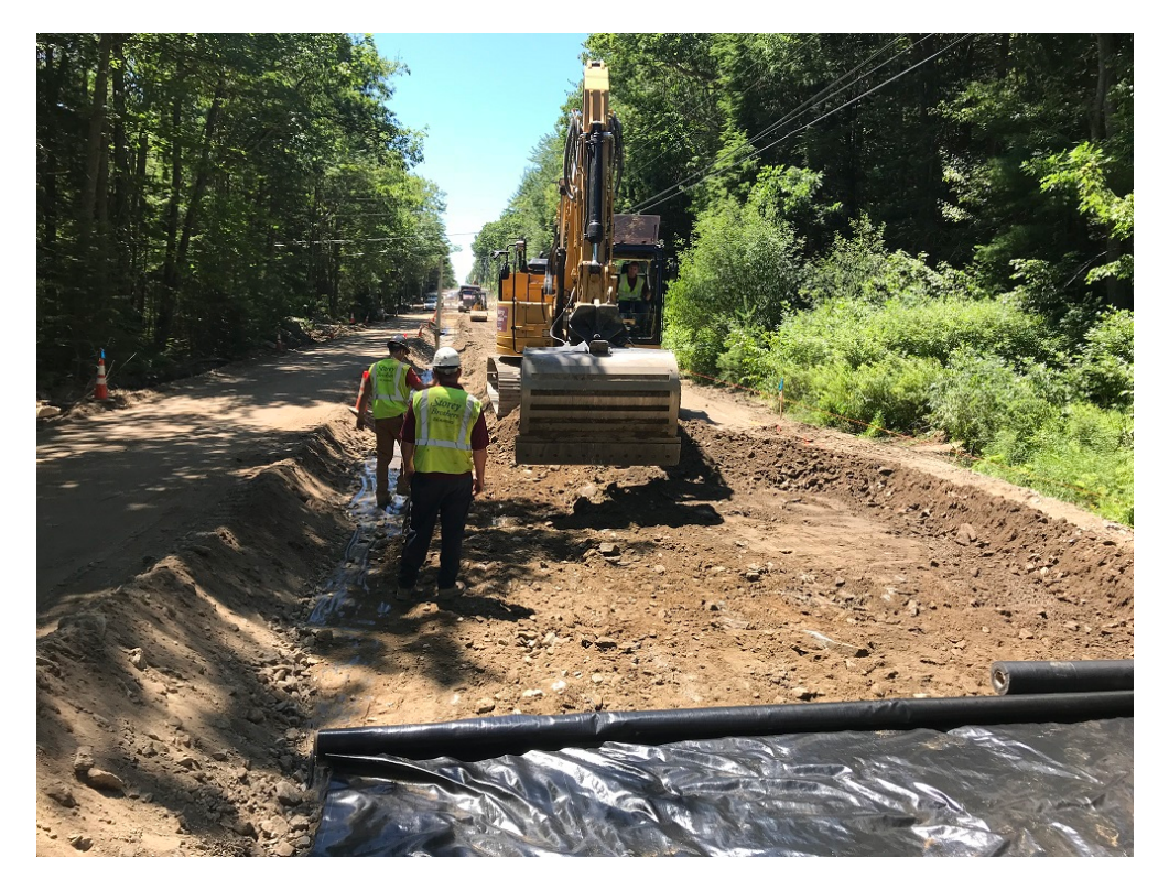
Photo 3 – Excavating to subgrade and placing fabric for full depth road reconstruction