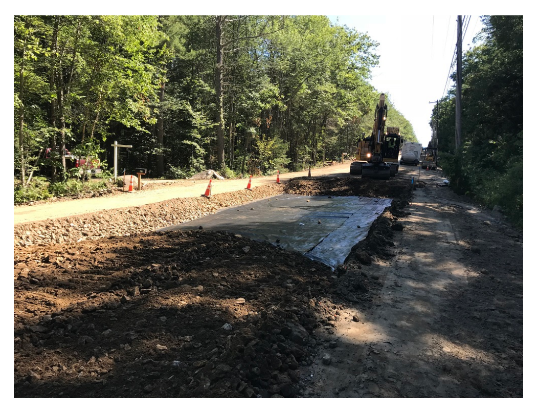
Photo 5 – West side of Middle Road at STA 10+50, ending point for the day