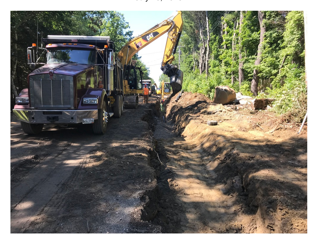
Photo 1 – Placing stone on 4 inch underdrain in front of 4 Middle Road