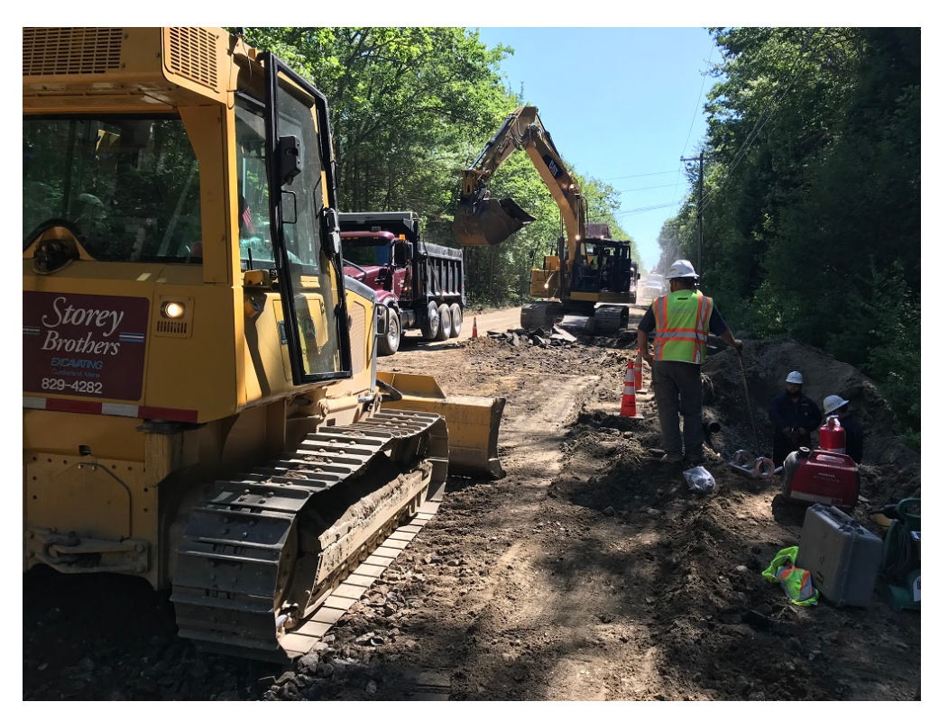
Photo 6 – Removing pavement for full depth road construction south of Evergreen Lane