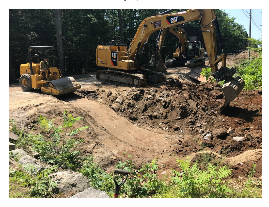
Photo 1 – Backfilling and compacting water service trench at 10 Middle Road