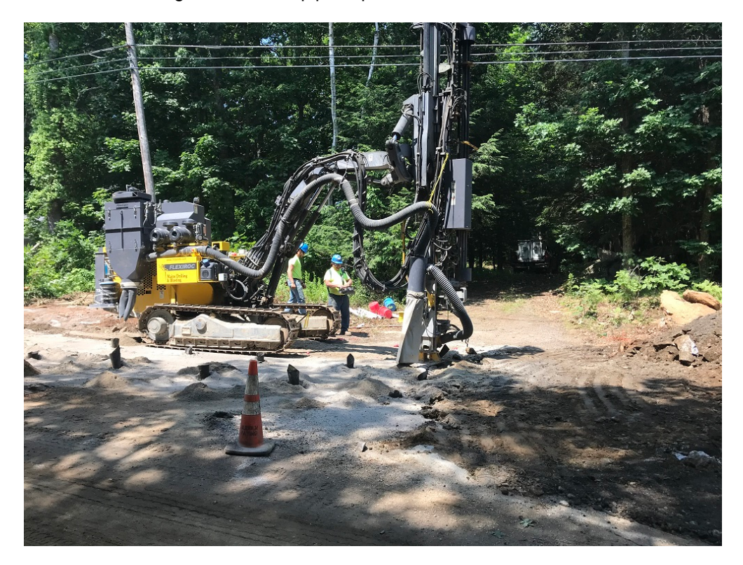
Photo 6 - Drilling for bedrock between 10 Middle Road and 4 Middle Road