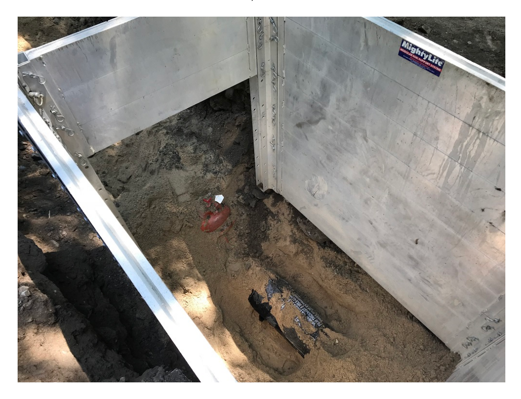
Photo 5 – 12 inch gate valve and pipe exposed at STA 0+85 for HYD installation