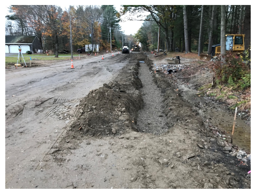
Photo 1 – Working on 6 inch UD at STA 24+00 southward on west side of Middle Road.