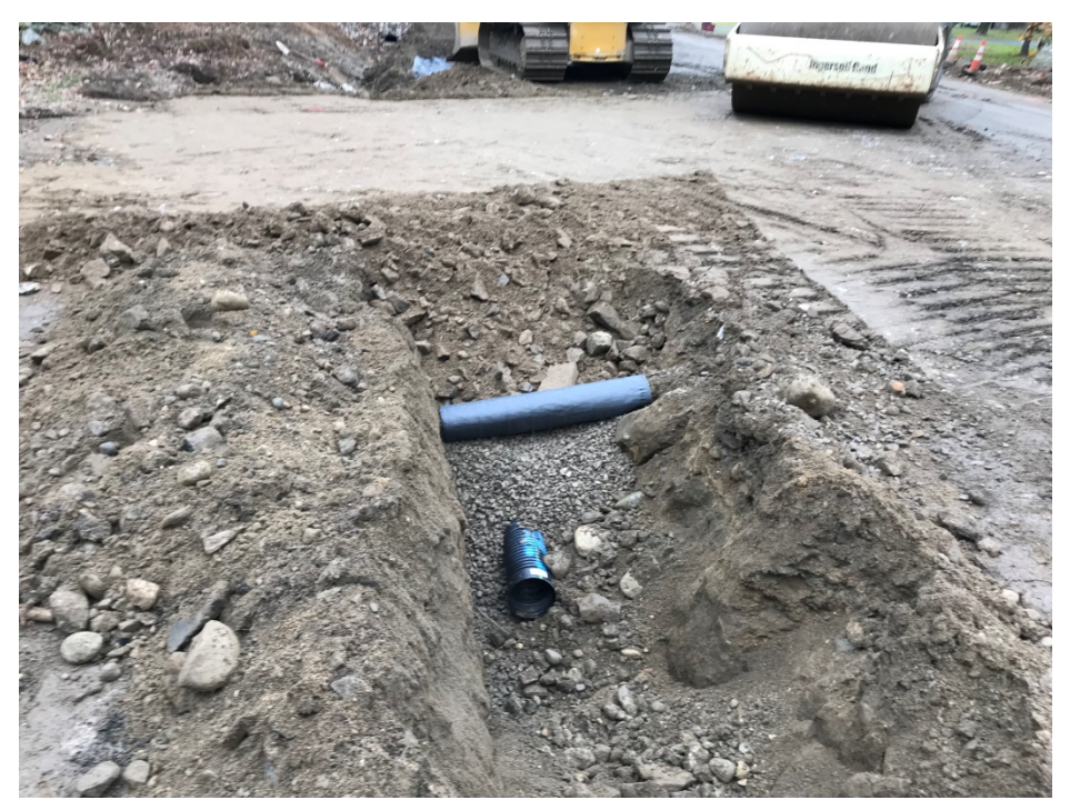
Photo 2 – Installing 6 inch UD on west side of Middle Road, STA 21+50.

Photo 1 – Working on 6 inch UD at STA 24+00 southward on west side of Middle Road.