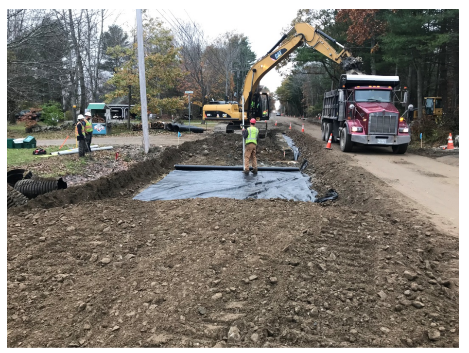
Photo 6 – Box cut for full depth construction east side of Middle Road, STA 24+00.