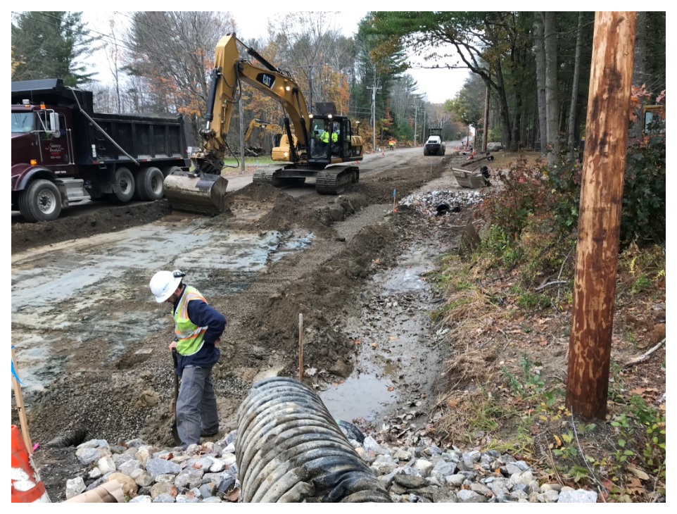
Photo 5 – Box cut for full depth construction on west side of Middle Road.