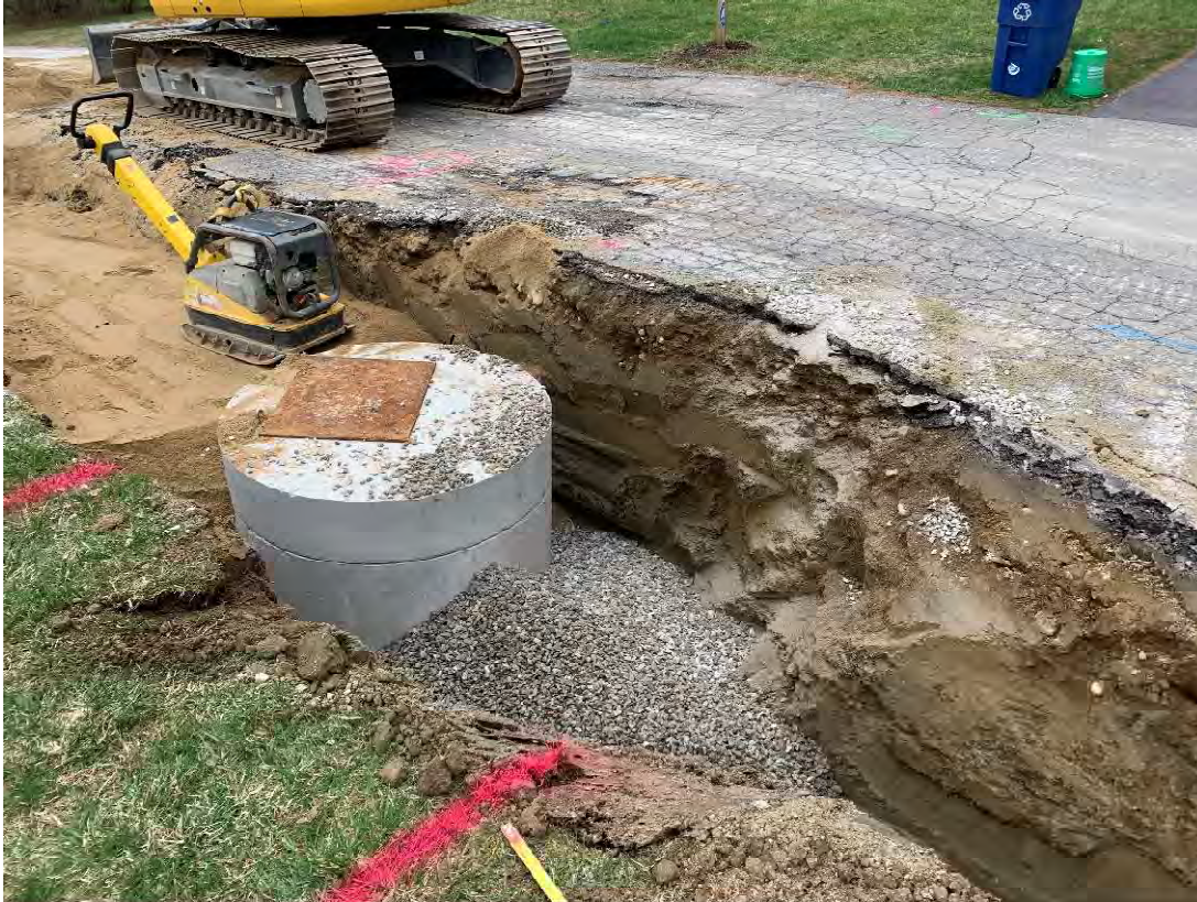
Photo 3 – 20-foot segment of 15" Perf. SD out of CB 5 backfilled with \frac{3}{4} " crushed stone approximately 1.75 feet from the spring line.