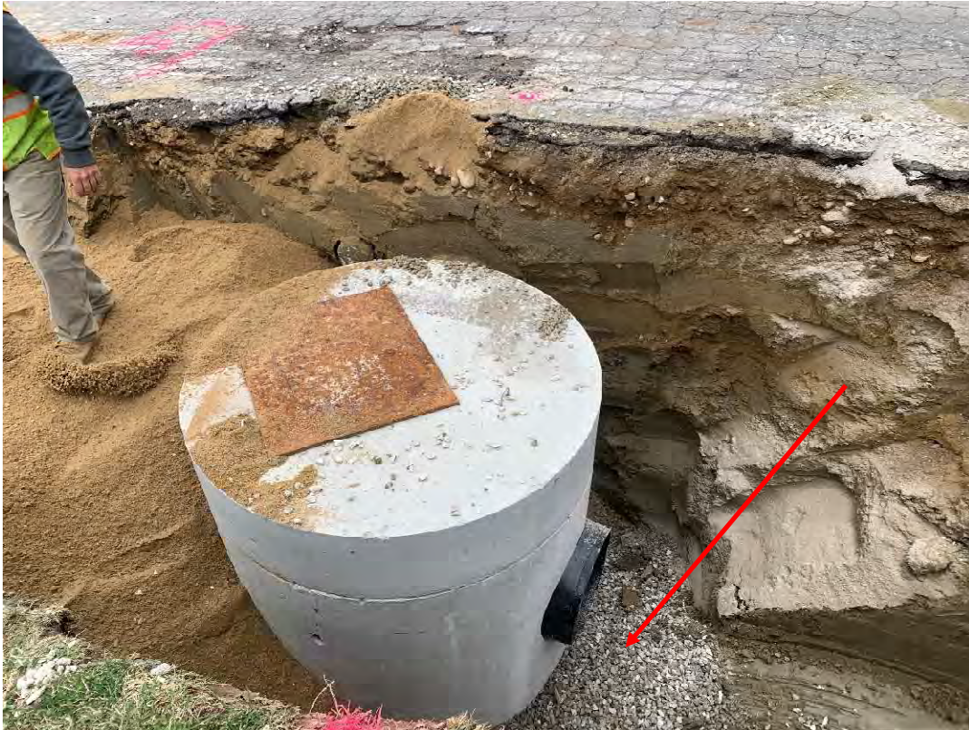
Photo 1 – CB 5 placed on material that appears to be \frac{3}{4} " crushed stone (pointed out in red).