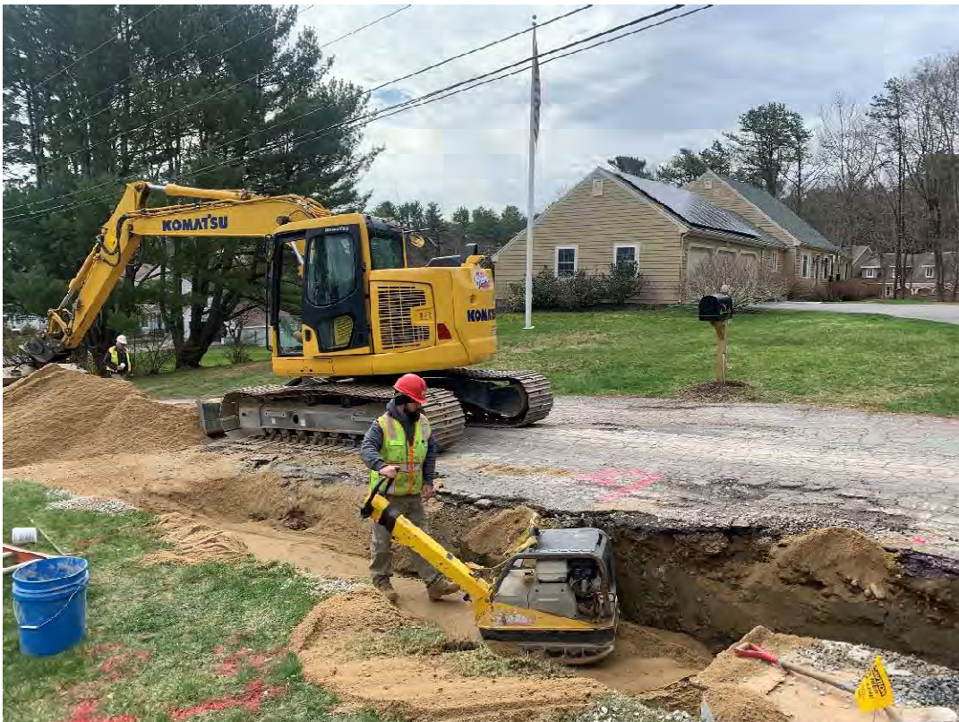
Photo 2 – 15" Perf. SD backfilled with MaineDOT 703.22 Type B Underdrain to approximately 18" below existing grade and compacted with efforts of a plate compactor.