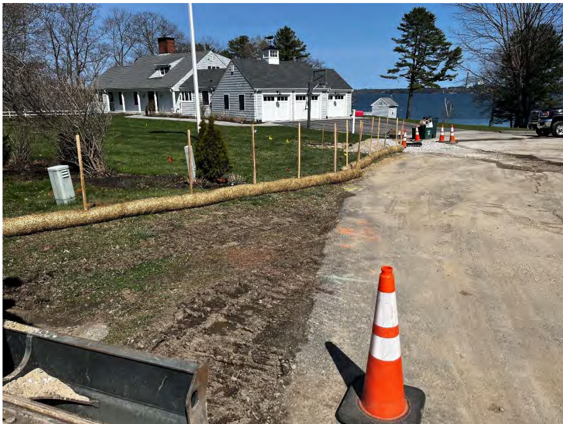
Photo 7 – Straw wattle installed around the perimeter of the northern portion of the cul-de-sac.