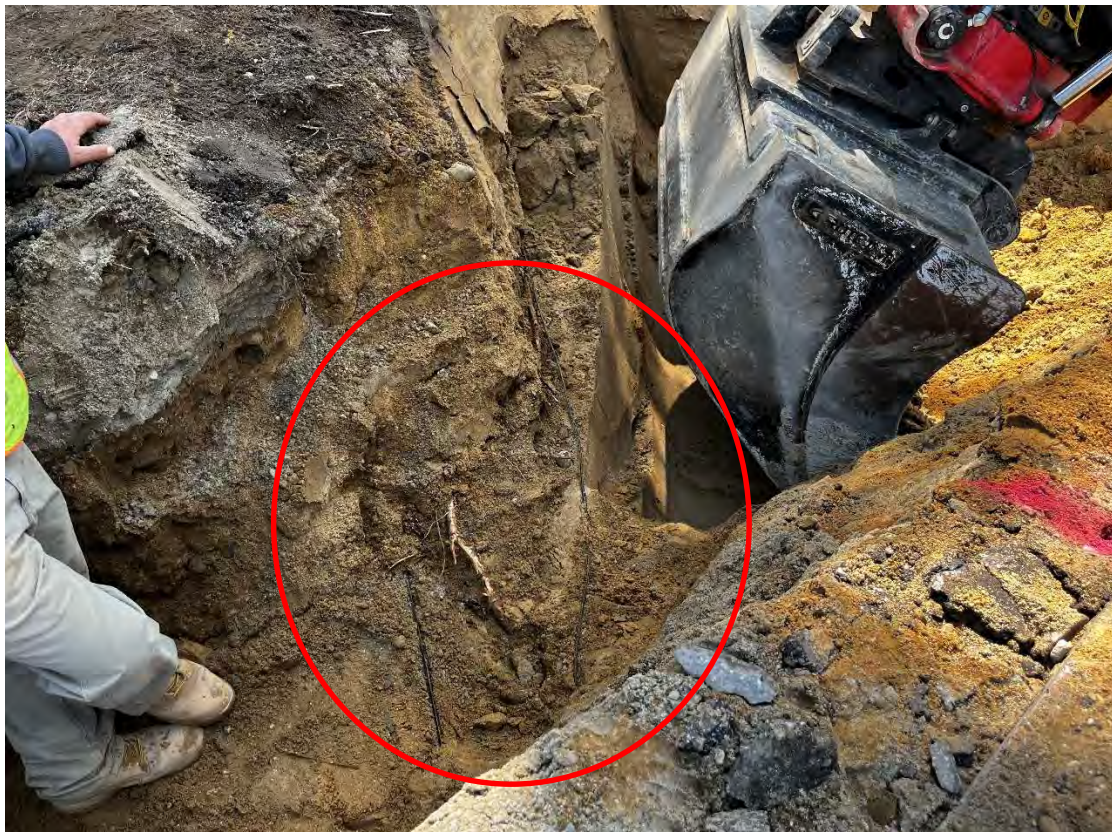
Photo 6 – Direct burial of conduit (circled in red) at 8 Longmeadow Road.