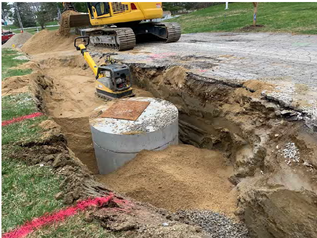
Photo 4 – CB 5 and the 15" Perf. SD being backfilled with MaineDOT 703.22 Type B Underdrain.