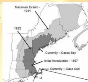
Browntail Moth Expansion by Year