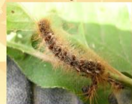
Infected browntail moth caterpillar