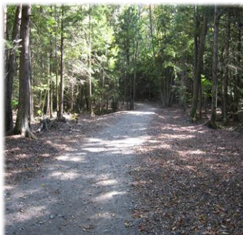
Trail work in Twin Brook to make the trails passable even during the rainy seasons