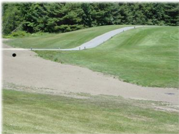
Drainage repairs and course improvements at Val Halla