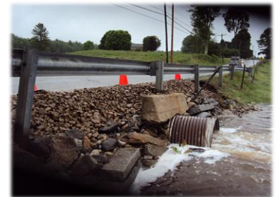
Road repairs and maintenance are an ongoing function of the department