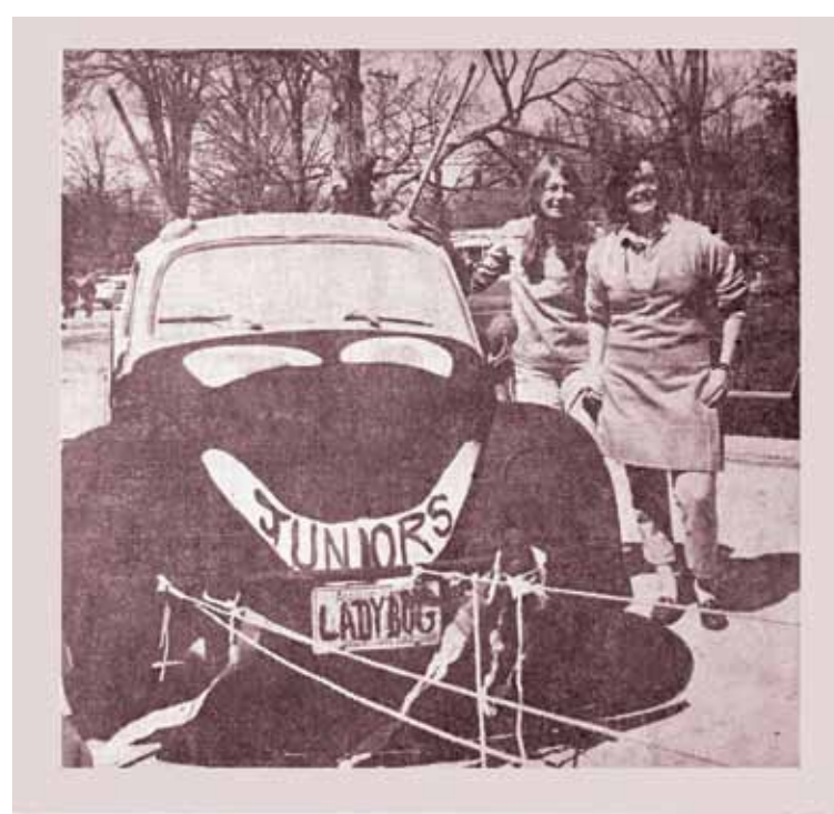
Meet The Mascot

The worm was to be the seniors' entry in the school mascot contest and the seniors had high hopes of their entry win-