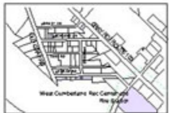
WEST CUMBERLAND DETAIL

Prepared by Cumberland Planning Department April 2000