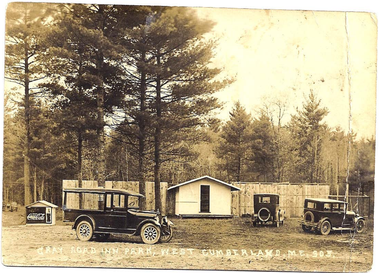
This wild animal park was located where Copp Motors now sits.