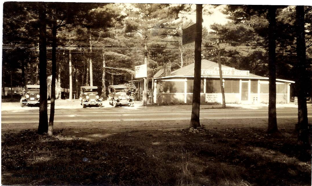
The Pride's Forest Lake Tea Room was located at the southeast corner of Route 100 and Blackstrap Road