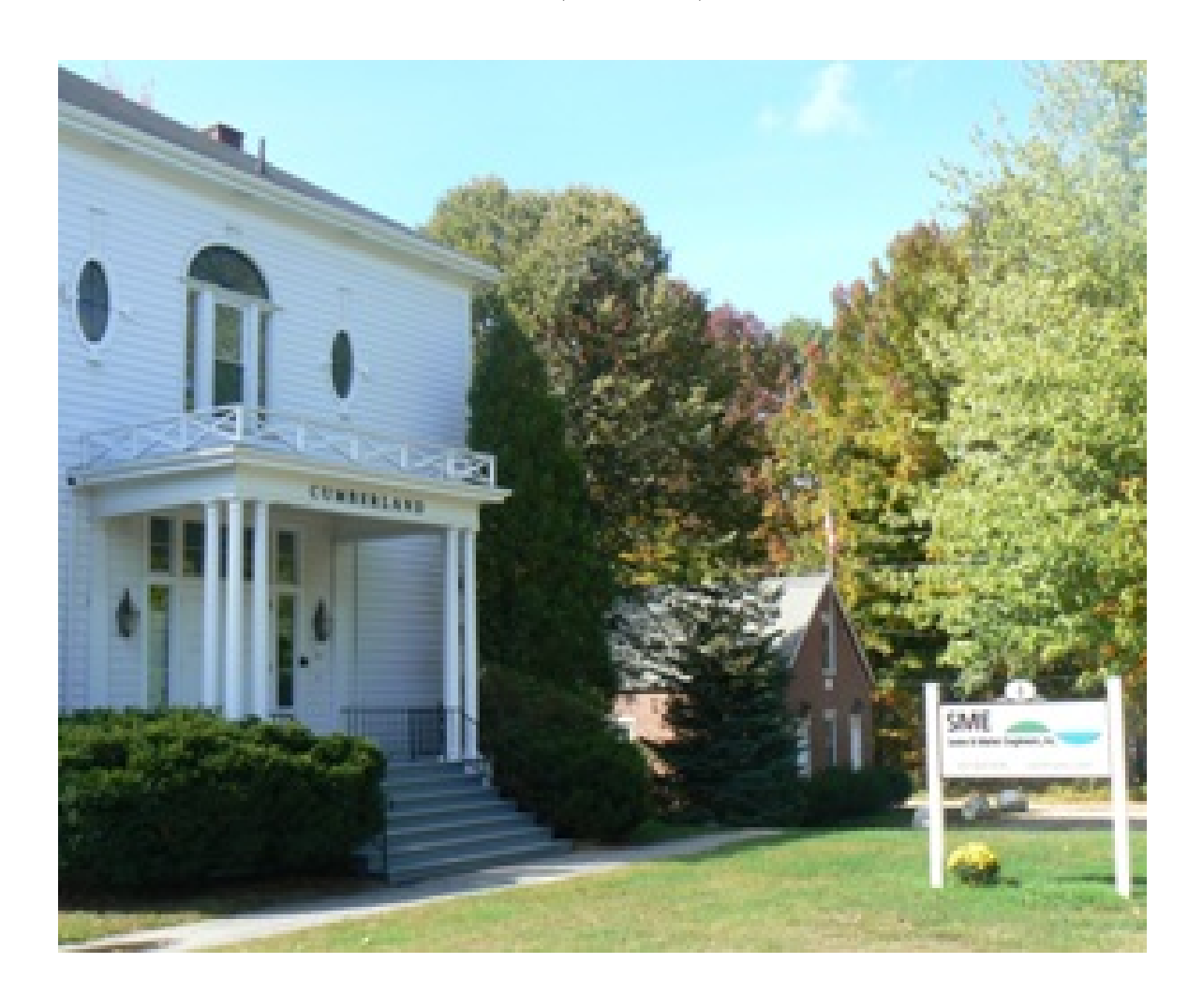
THANKS ALSO FOR THE GARDENING SUPPORT FROM SKILLINS GREENHOUSES, WEST CUMBERLAND, MAINE