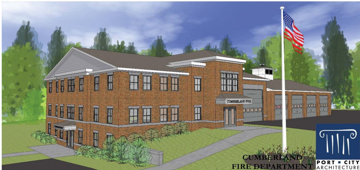
Side View- 6' to 8' Grade difference